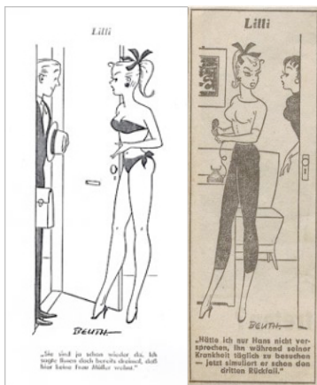
Figure 3: Bild Lilli Cartoons (Dates Unknown)