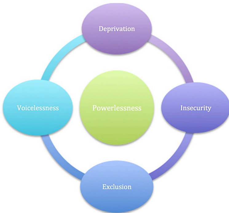
Figure 4.0: Factors of Poverty

Living in poverty means facing deprivation, that is, the lack of food, housing, adequate water and sanitation, etc. It also includes being deprived from the opportunities to better one’s life via education, secured employment, and protection of assets. Deprivation also affects the security of a person, which is