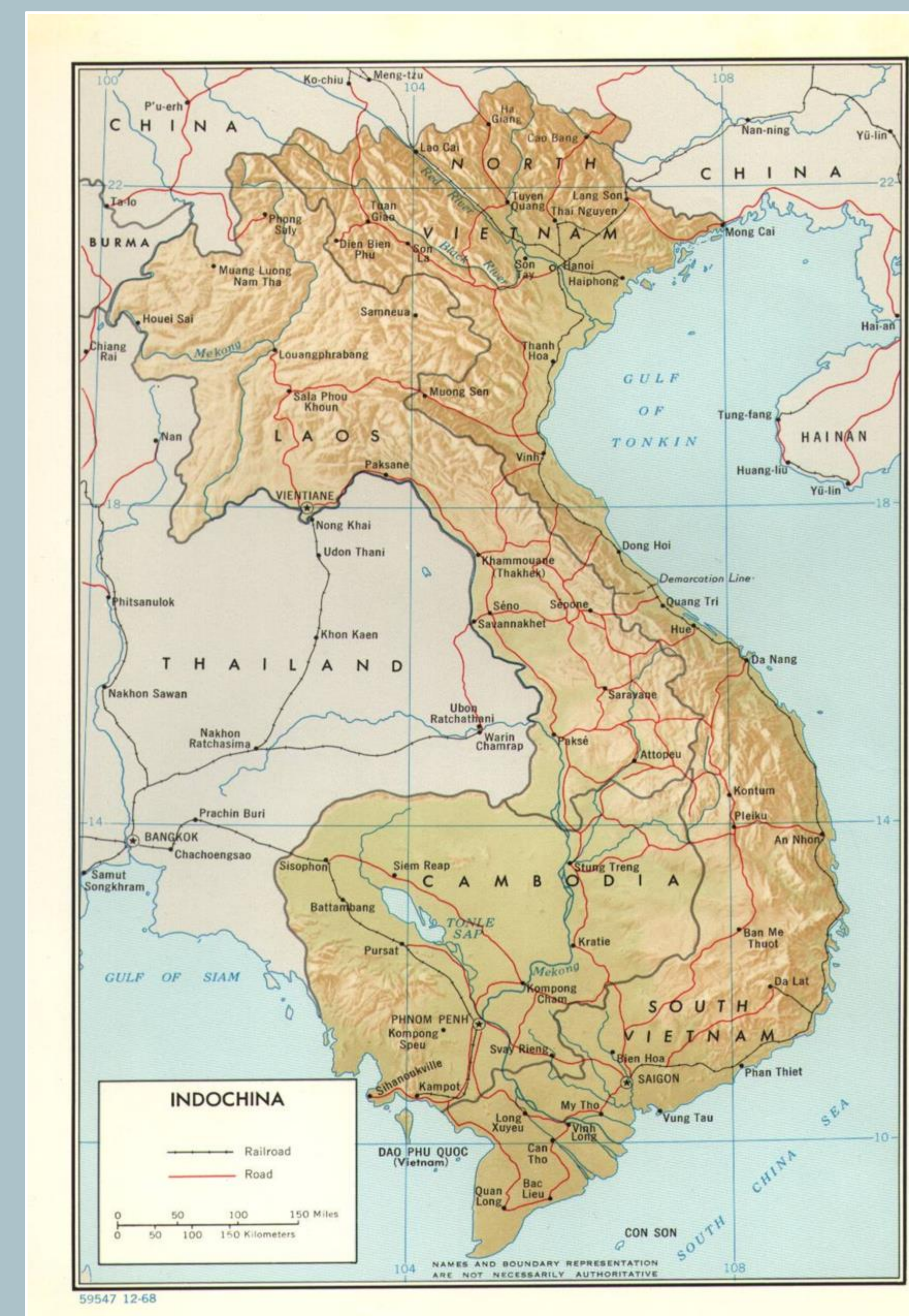
Map of French Indochina

French Indochina consisted of Cambodia as a protectorate by 1867; Vietnam divided into three areas by 1885: Tonkin (North Vietnam) and Annam (Central Vietnam) as protectorates, and Cochinchina (South Vietnam) as a colony; and Laos as a protectorate by 1893.