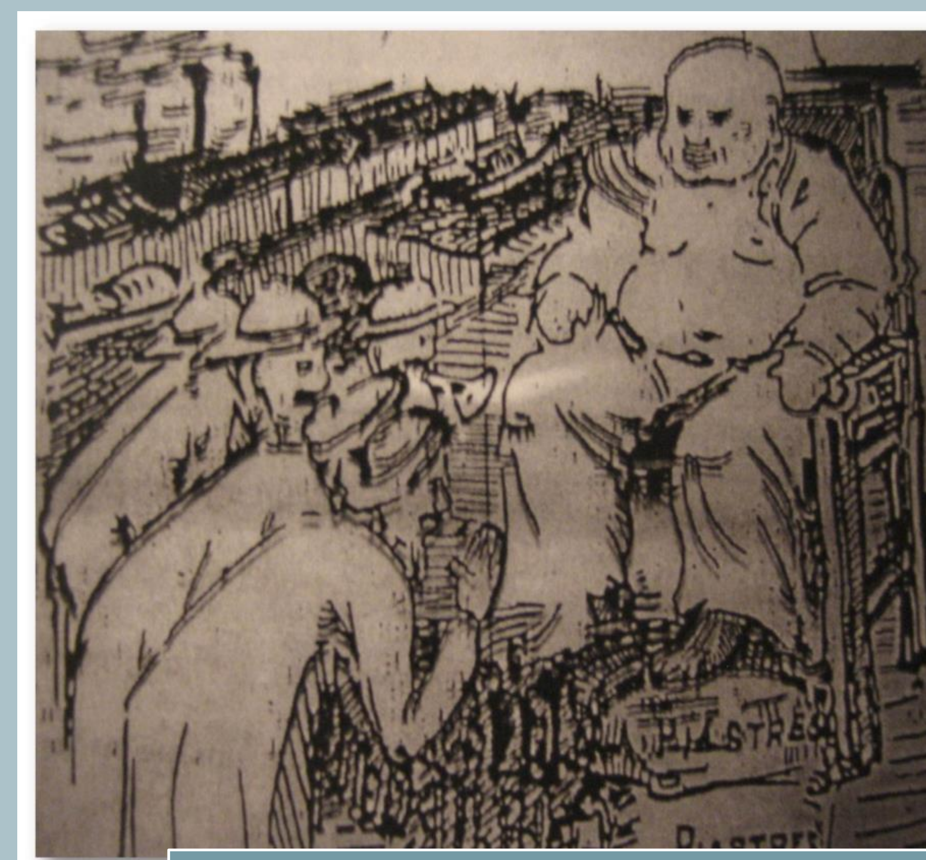
La Tribune indégène , 25 November 1920. Caption: “Sus aux Chinois.”

The research points to the fact that prior to French colonisation there had already been an influx of Chinese businessmen during the Nguyen dynasty; however, the Nguyen dynasty did their best to ensure that the Chinese population was assimilated. While the rationale for this had not been to prevent anti-Chinese sentiment but rather to maintain “Vietnameseness,” this meant that the Chinese were not blatantly set apart from the Vietnamese. The French administration, by contrast, favoured the Chinese in their economic policies as well as public policies and urban planning for racial and economic reasons. All the while the Vietnamese middle-class blamed the Chinese and did not see the French as to blame for their economic plights. The French did not see a need for assimilationist policies and so these came to an end. As a result, the Chinese congregated in tightly knit groups, such as in the large Chinese enclave of Cholon. Their seeming economic superiority became blaring to the Vietnamese, thus contributing to anti-Chinese sentiments.