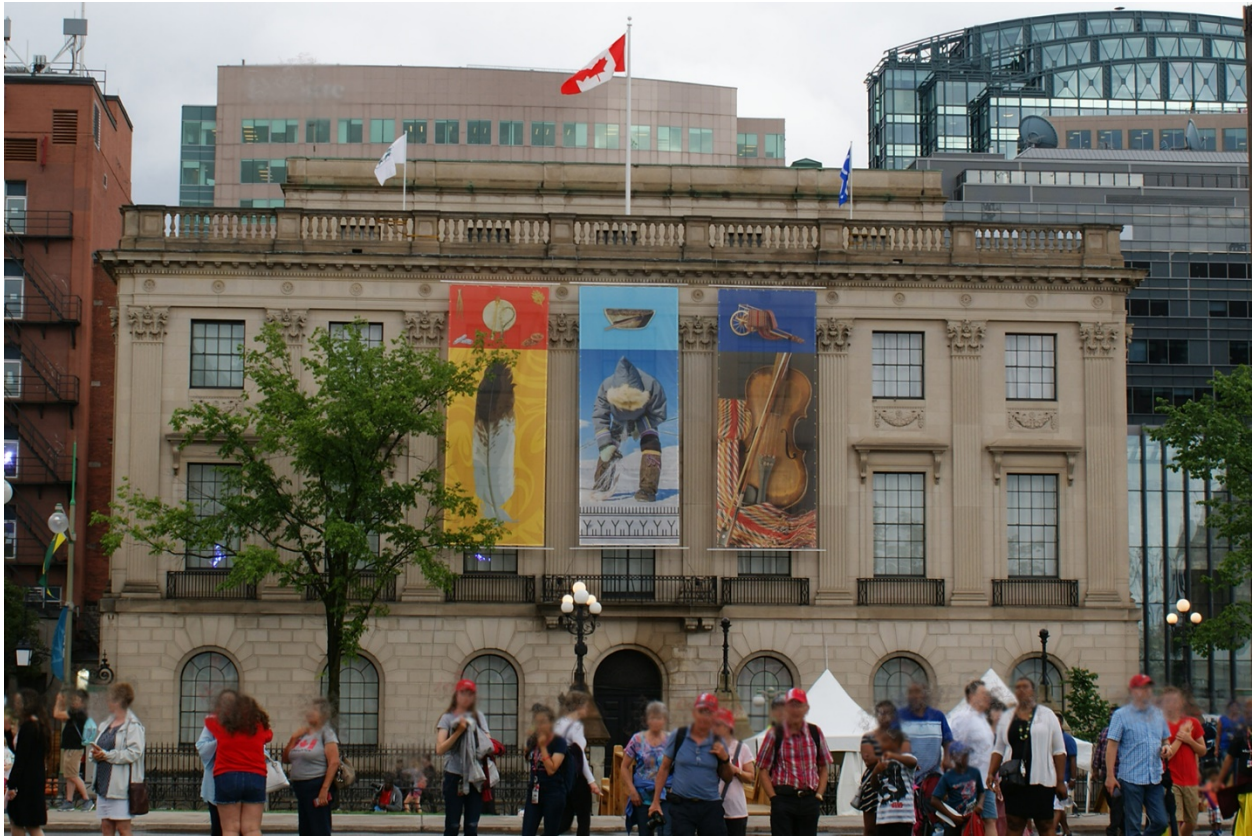
(Note: All personal and corporate identities have been obscured)

The forth-coming national Indigenous cultural centre.