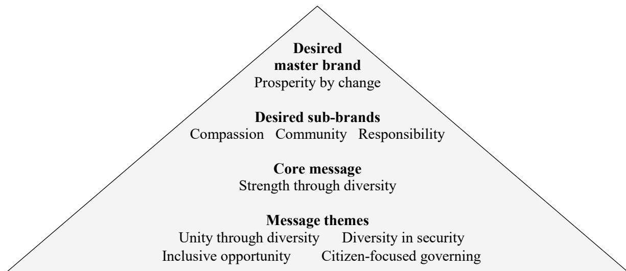
Figure 4.1. Components of Justin Trudeau’s Liberal Party of Canada brand, 2017. Adapted from “Brand Command,” A. Marland, 2016, p. 44.

This ties in with a recent national survey, as noted in the literature review that the Charter is a key symbol and Human Rights is a key shared value of Canadians, far surpassing that of bilingualism (Sinha, 2015). The Liberals' master brand is no longer about unifying a bilingual Canada (Marland, 2017b), but instead about inclusivity, multiculturalism, and the like, all of which are grounded in the Charter. Thus, Charter values and rights-focused positioning is nascent throughout Liberal communications and make up the backbone of the Liberal Party of Canada master brand (Figure 4.1).