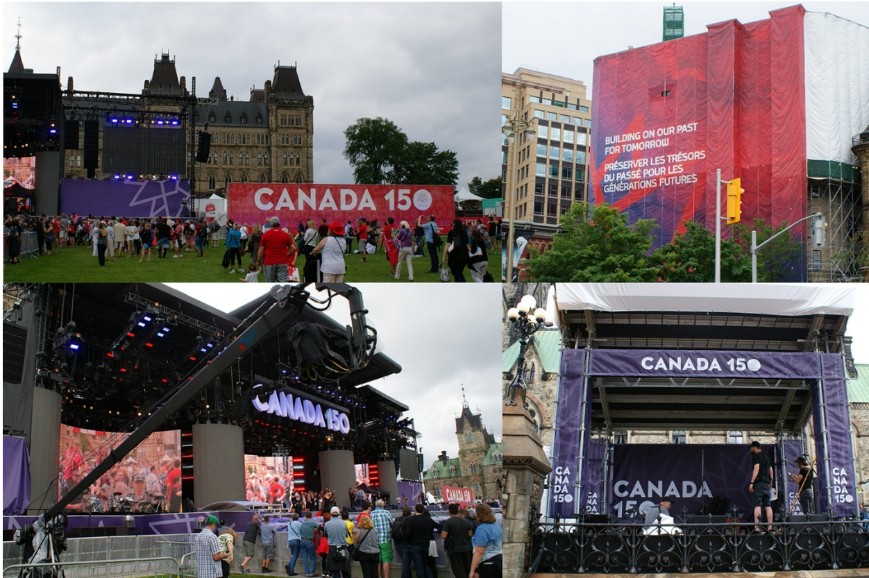
(Photo credit: Justin Prno. Note: All personal and corporate identities have been obscured)