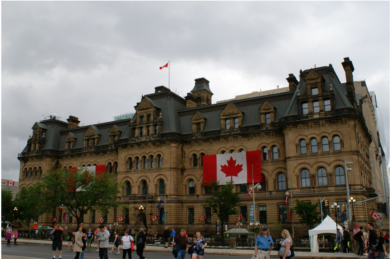
(Photo credit: Justin Prno. Note: All personal and corporate identities have been obscured )