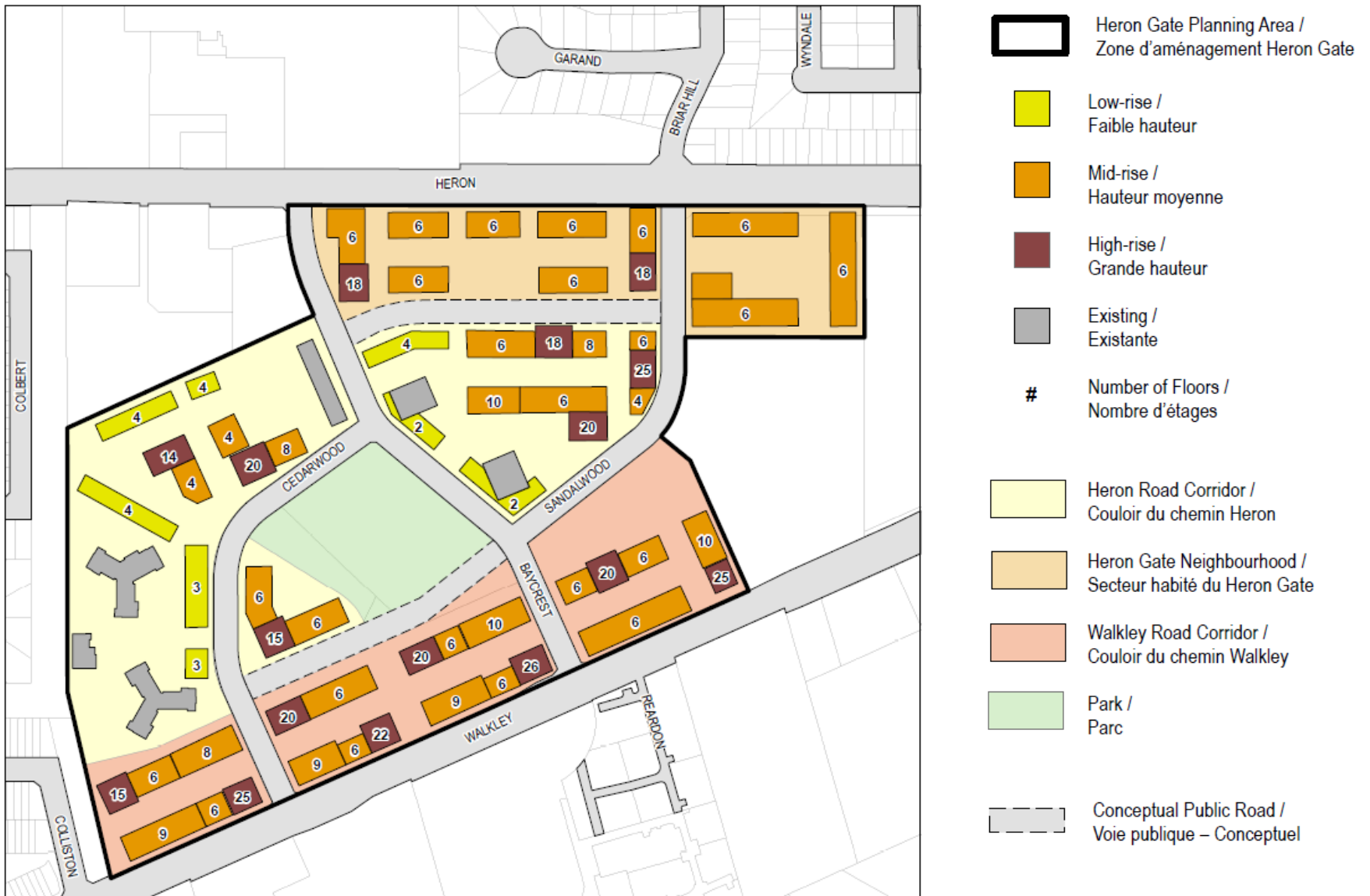
Figure 2. Hazelview Investments’ planned redevelopment of an area of Herongate. Adapted from City of Ottawa, 2021b.