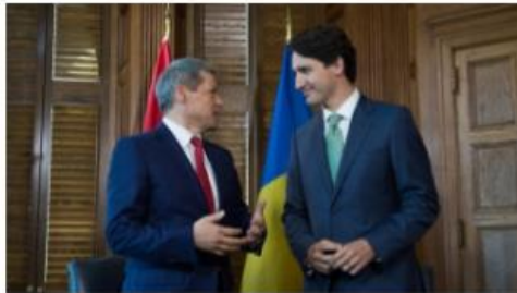
Prime Minister Justin Trudeau meets with Romanian Prime Minister Dacian Cioloș in Ottawa (eng/photo-gallery/prime-minister-justin-trudeau-meets-romanian-prime-minister-dacian-ciolos-ottawa)

See all photo galleries ... (eng/photos)