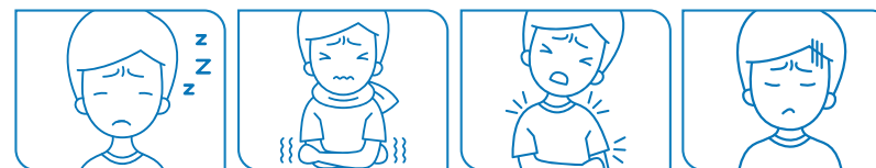
Generally feeling unwell Chills Muscle aches Fatigue or weakness