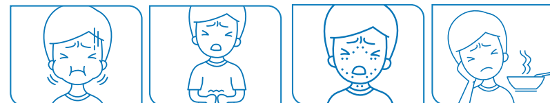
Nausea or vomiting Abdominal pain Skin changes or rashes Loss of appetite

If you have TWO or more of these symptoms, please stay home and contact public health for next steps.