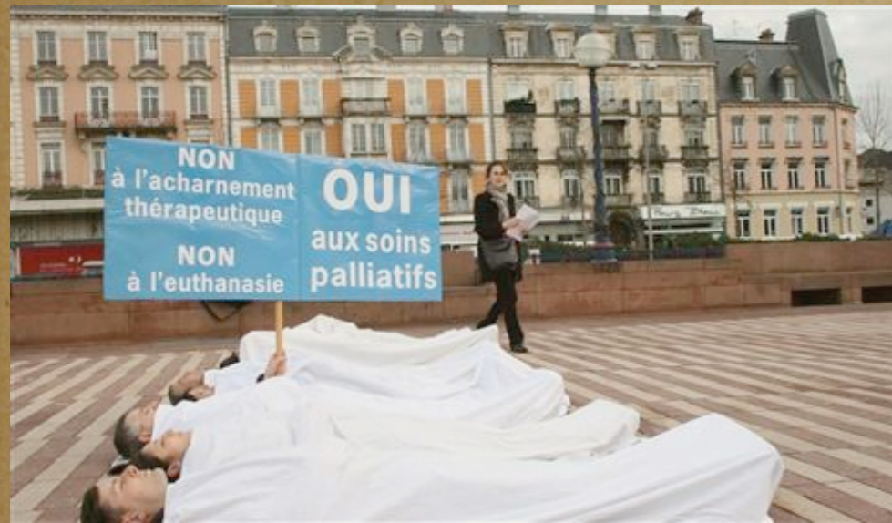
Demonstrations against Euthanasia in Belgium