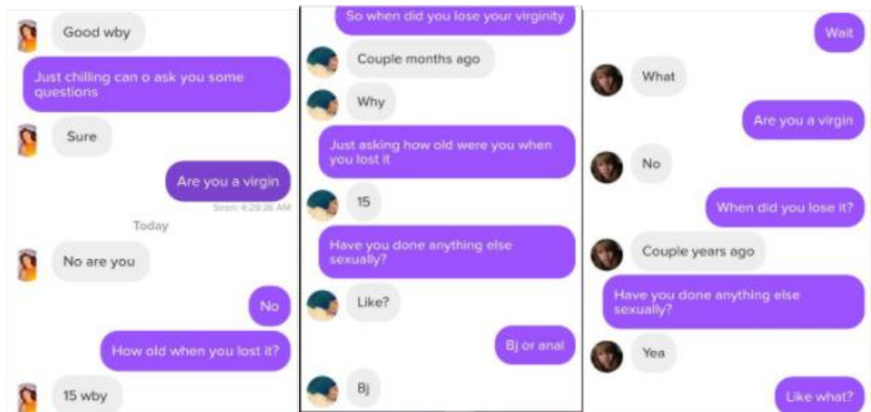
Images 1, 2, 3: Screenshots from Tinder experiments regarding virginity.

[dokterdoom] in response to [MSCW]: “I mean they do, but this is why we need chastity devices, to protect both boys and girls, state sanctioned and enforced monogamy and enforced virginity until 21, sex licenses, and state ran camps for sluts, mansluts, pedos, rapists, cucks, etc.” (May 26, 2018)