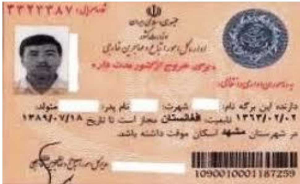
Afghan ID card issued years: 2012- July , 2013