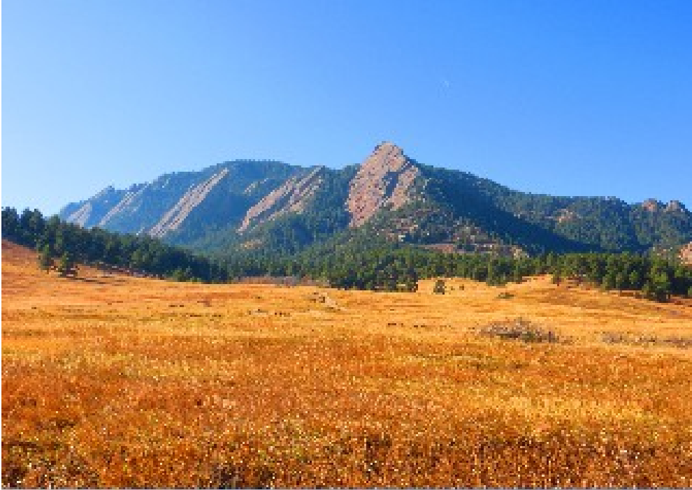
Figure 5. The Flatirons seen from the Chautauqua Park hiking trail.

Boulder is an ideal city for sport enthusiasts, especially runners who come to train at the high elevation to improve their lung capacity. Boulder is surrounded by thousands of acres of open recreation space, nature preserves, and conservation easements. There are almost 36,000 acres of open space available to the public, which include world class hiking trails and rock climbing, the most popular being Chautauqua Park in the west end of the city. The trails vary in difficulty in this area and are often used by runners, hikers, bikers, and rock climbers. Boulder is also home to the U.S.A. Ultimate organization, as well as the headquarters of U.S.A. Rugby and U.S.A. Climbing.