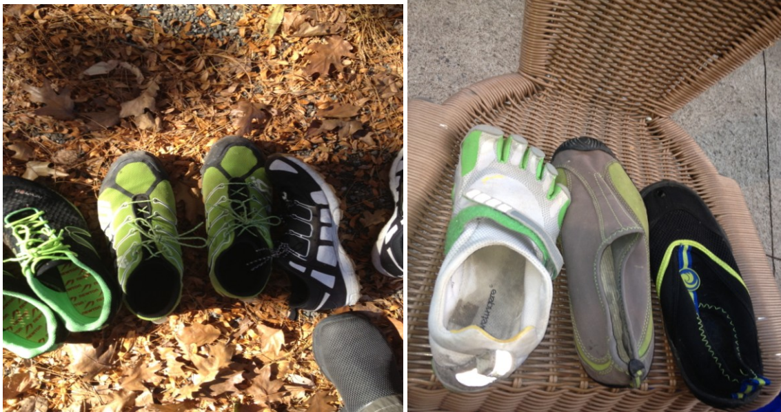
Figure 4. Photos of participants varied shoes and water socks that they use to run in a minimal style. From left to right these include Newton, Innov8, Newton, Vibram Five fingers and two pairs of water shoes. The shoes on the left belong to a participant in Boulder; the shoes on the right belong to a participant in Ottawa.

leather. When socks, shoes and sandals have failed to give him the experience that he desires, he has removed them and simply run unshod.