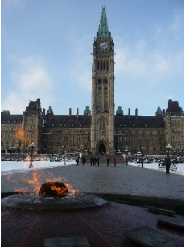
Figure 3. Parliament Hill and the Centennial Flame in downtown Ottawa.

Ottawa is very pedestrian and cyclist friendly, biking and running paths crisscross the city and run along the waterways of the Canal and the Rideau River.