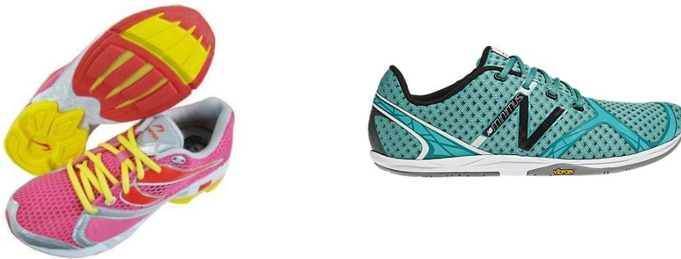
Figure 1. A side-by-side comparison of the two minimalist style running shoes I wore, the Newton Distance U shoe (pictured left) and the New Balance Minimus Zero shoe (right).

short run to and from the practice site, as well as several drills meant to alter strike patterns and cadence of runners. Participants were encouraged to wear shoes from Newton and these were loaned to them at the beginning of class so they could experience a 'natural' style of running in a 'natural shoe'.