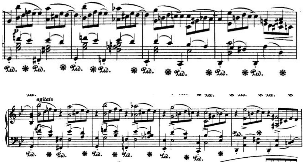
Figure 3.2 - Chopin Ballade No. 1 Op. 23 mm. 36-43

performer could imagine Romeo running eagerly towards Juliet to bring out the momentum set in the music (non-pianistic kinesthetic imagery).