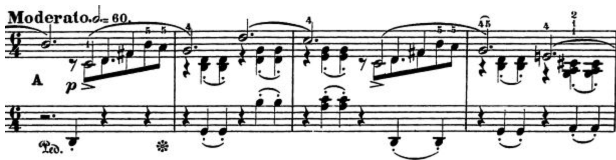
Figure 3.5 - Chopin Ballade No. 1 Op. 23 mm. 8-11

Then as well, pianistic kinesthetic imagery produces a similar outcome as evident in the first statement of theme I (mm. 8-35). The waltz-like rhythm derived from the left hand part and the melody in the right hand stands out from the rest of the movement. In this section, the performer could imagine the hammers inside the piano bouncing lightly as the waltz rhythm progress. This kinesthetic pianistic imagery may guide the performer in producing the desired articulation (as indicated on the score) in order to replicate the waltz style (Figure 3.5).