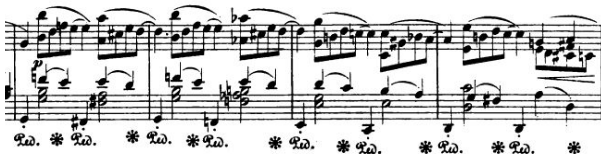
Figure 3.4 - Chopin Ballade No. 1 Op. 23 mm. 36-39.

Pianistic auditory imageries function similarly as the performer imagines the melodic contour prior or during the performance. Such imaginary auditory feedback guides expressive creation as the performer mentally prepares the execution of the desired sound. For example, the section from mm. 36-44 possesses distinctive feature in the syncopated rhythm and melodic contour in the left hand. (Figure 3.4) When preparing or performing this section, the performer may use auditory imagery according to the expected syncopation. By running through the syncopated rhythm in mind, the performer prepares the delivery of this special passage.