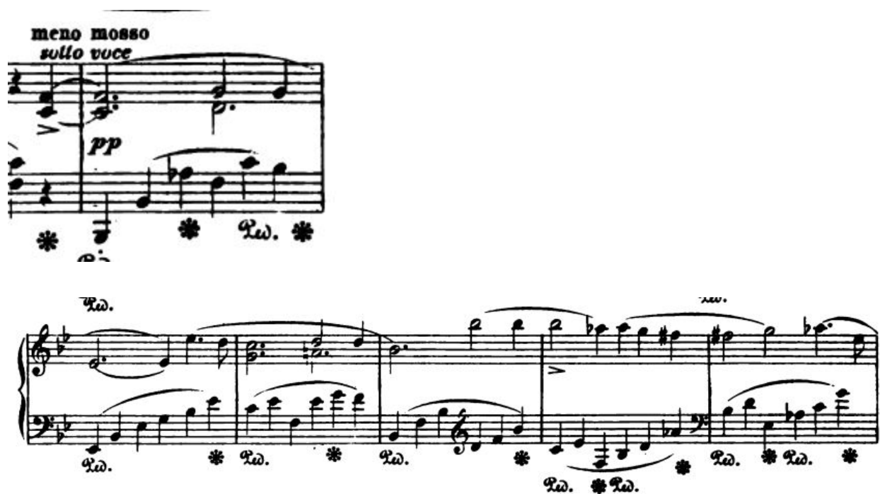
Figure 3.4 - Chopin Ballade No. 1 Op. 23 mm. 67-72

on them by assigning memorable parts as a means for association. In this case, by having a plot and differentiating characters by their importance, the performer may have a clear understanding of tension and release in the piece. In the midst of frequent melodic and harmonic changes during this transition section, the performer could use a non-pianistic visual imagery, such as imagining characters running and raising swords at each other, to enhance the mental picture of the atmosphere that she wants to portray. Stepping onto the famous balcony, scene III starts on m. 44 and ends at m. 66. This balcony scene takes on a sweet romantic character expressed through the lyrical melody line and arpeggiated harmony in the accompaniment. At this moment, the performer can generate a non-pianistic auditory, such as imagining the arpeggio patterns as finger patterns on Romeo's guitar, to illustrate a dreamy scene. (Figure 3.4)