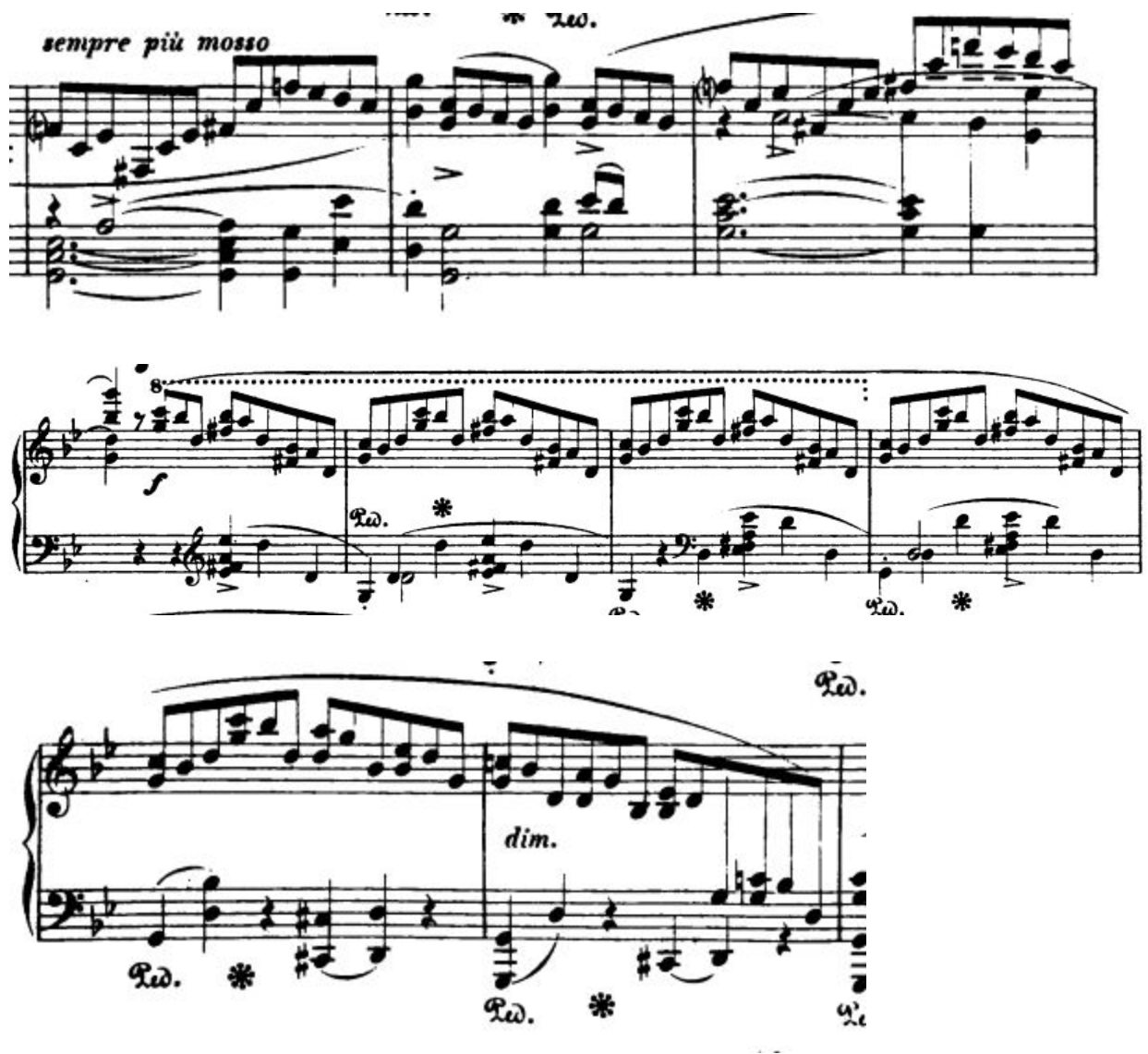
Figure 3.3 - Chopin Ballade No. 1 Op. 23 mm. 44-52

This contrast in melodic contour correlates to the notion of the importance of main characters and the purpose of supporting roles. Although stopped by Juliet's father, Tybalt's agitation corresponds to the rapid change in harmony and a stream of rapid passages. In this case, Tybalt's scene from mm. 44-66 acts as a transition between important scenes. When a pianist decides on her story line and identified a group of main characters, it is reasonable to place more emphasis