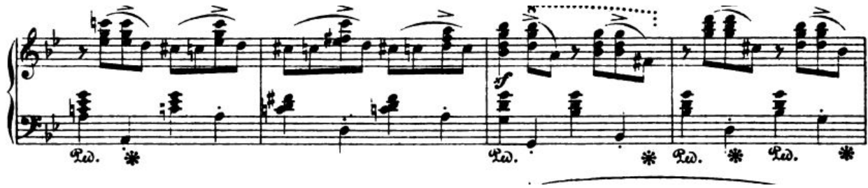
Figure 3.6 - Chopin Ballade No. 1 Op. 23 mm. 206-211.