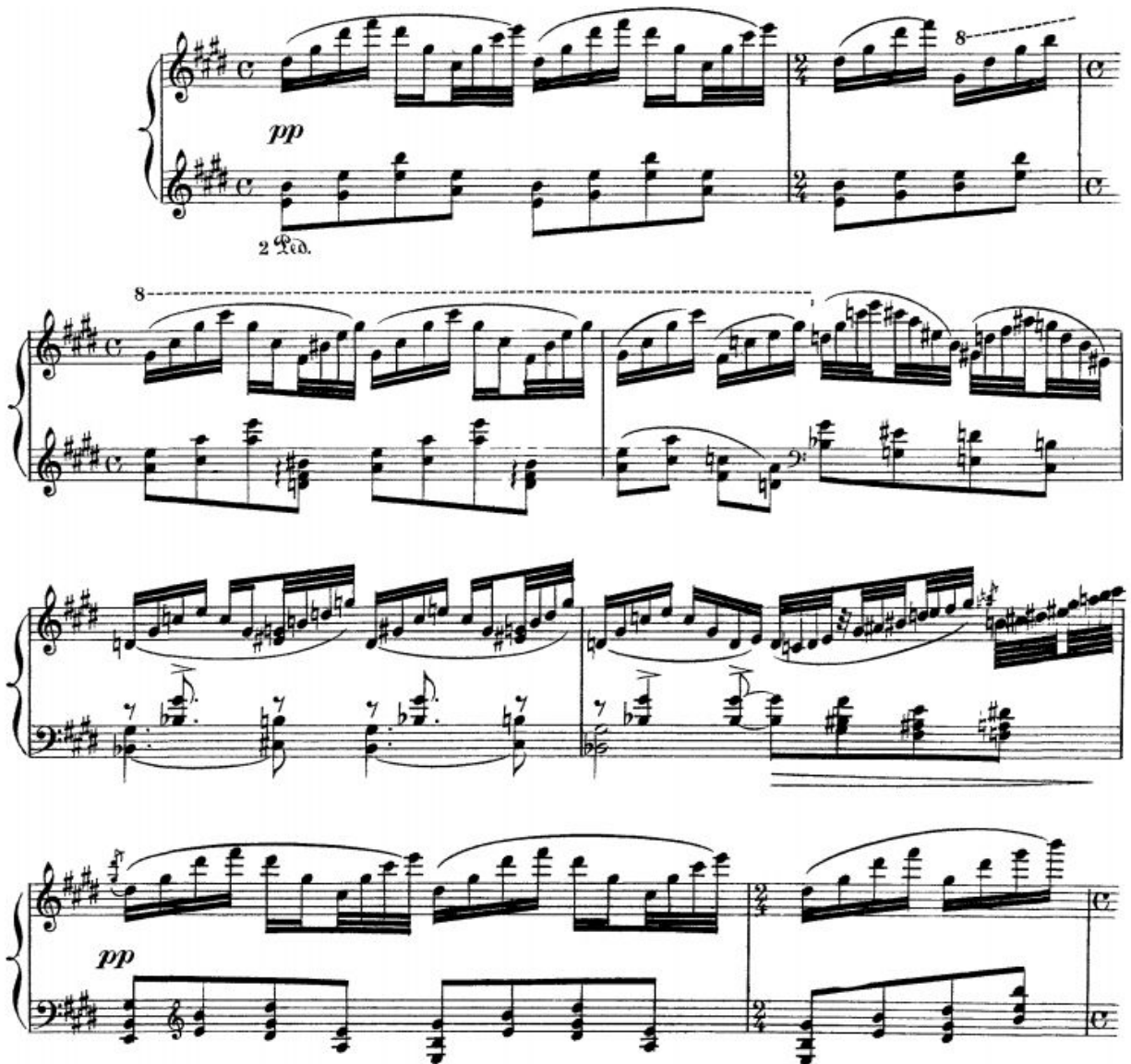
Figure 2.4 - Ravel, Maurice. Tres doux. Mineola: Dover Publications, 1986.

images in mind, pianists may deepen their engagement with the piece than if they were to perform without a plot in mind.