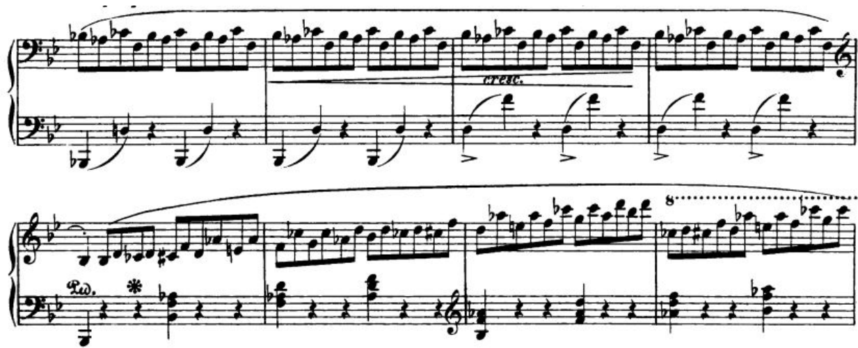
Example 9 - Chopin Ballade No. 1 Op. 23 mm. 126-133.

fast moving harmonic rhythm and chromatic pitches, reminds the audience of the conflict that gives rise to the duel (Figure 3.5). To portray the tension at the point, the performer could imagine the sound of frequent footsteps as Tybalt runs eagerly towards Romeo (non-pianistic auditory imagery). While this section brings contrast between both statements of “Romeo’s affair,” this restatement involves less stress and tension, which corresponds to Romeo’s perspective as he views Tybalt as one of his family members. Despite Romeo’s intention, Tybalt starts a fight with Mercutio at mm. 150. This third “Tybalt” scene also captivates the chromatic and fast moving feature as shown in previous statements. When the performer aims to present the friction between the characters, she could use non-pianistic kinesthetic imagery by imagining the characters moving rapidly and raising swords against each other. While all these chaos and confusion ensue, the play switches the point of view onto the main characters. Romeo and Juliet meet again at the balcony and plan their escape during the following sections (mm.166-193). With the use of accelerando and continuous moving lines in both hands stream through with