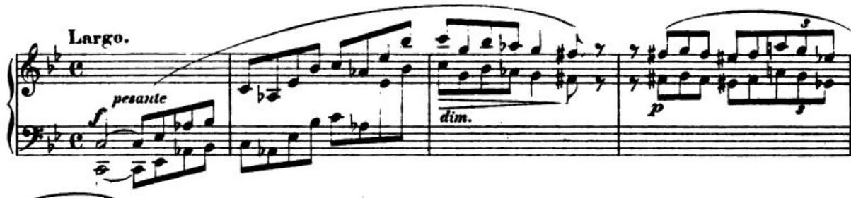
Example 3.3 - Chopin Ballade No. 1 Op. 23 mm. 1-7.

1-7, where the pianist could produce an imagery of the rising figure of the melody which could guide the specific input on strength used in striking every note. (Figure 3.3)