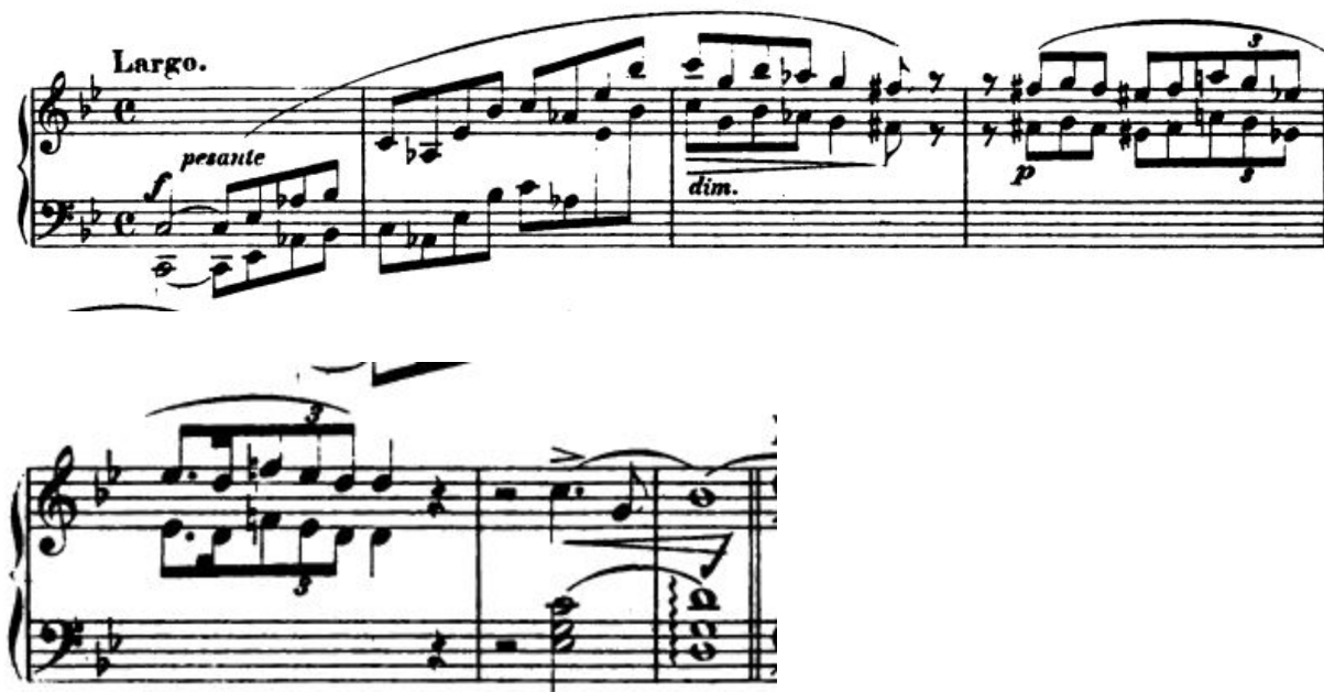
Figure 2.2 - Chopin, Frederic. Edited by Rudorff, Ernst. Ballade No. 1 in G Minor, Op. 23. Leipzig: Breitkopf und Hartel, 1881.

In the auditory category, pianistic imagery can refer to the musician’s ability to mentally “hear” or “play through” a given piece, whereas non-pianistic audio imagery is used to hear sounds that are not specific to the music itself as in the sounds that one might image in a story or scene. 25 Using Debussy’s Arabesque no. 1 as an example, pianistic audio imagery could involve the mental hearing of individual notes, phrases, and dynamic levels. The pianist may also imagine the direction of notes as she hears the piano sound lowers gradually from mm. 6-9 (Figure 2.3). With a sense of the sound in mind, such pianistic imageries may help pianists to accurately produce it by motivating a specific touch and, therefore, tone. Non-pianistic audio imagery in this particular section may involve hearing of waterfall sound, dripping water drops, or the breeze through a falling flower pedal. The blurry atmosphere of the piece may also suggest