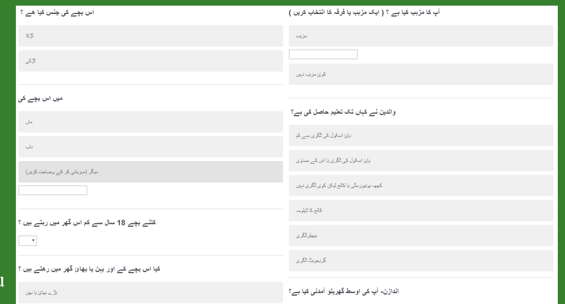
Figure 2. Qualtrics output displaying the Urdu translation of some questions in the Demographics questionnaire