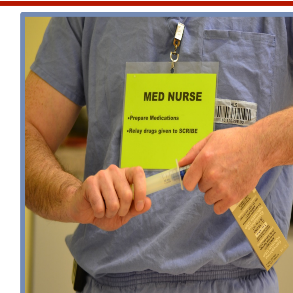
"Med Nurse" roles include preparing medications, and relay drugs given to scribe