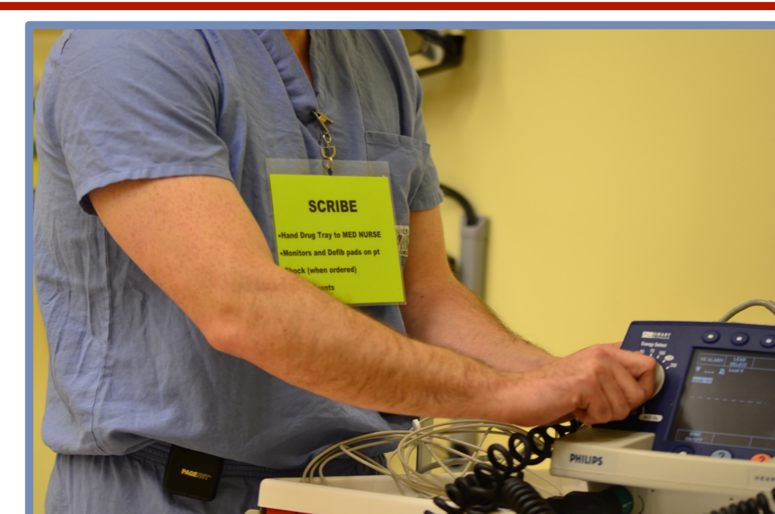
"Scribe" roles are to monitor defibrillator and shock, and hand drug tray to nurse