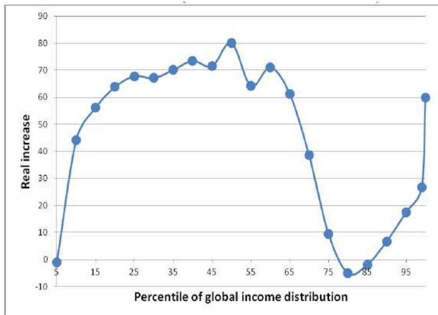
Figure 1: Global Distribution of Income 1988-2008

of globalization that drives inequality on a global scale. One particular graph (figure 1) that illustrates Milanovic’s argument is showing the percentage gain in real household per capita income between 1988 and 2008 at different points of the global income distribution. The findings in their data have suggested that the real income gains were the greatest in the 50 th percentile of the global distribution (middle-class in developing countries, i.e. China and India) and the richest top 1% in developed countries. Milanovic concluded the biggest losers during this period were amongst the people around the 80 percentile, which are the West’s middle-class. 60