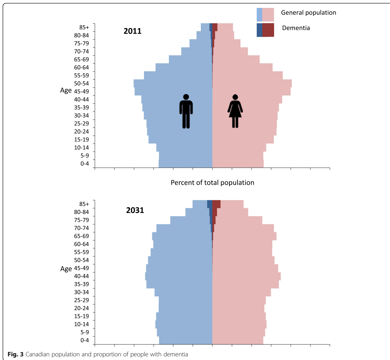
Fig. 3 Canadian population and proportion of people with dementia

analyses of the main model parameters and found that dementia incidence and age of diagnosis had a strong influence on prevalence. As well, we present the distribution of informal caregiving hours received (Table 2) to demonstrate how model projections using a microsimulation approach can readily include distributions of model inputs and/or outputs. The approach to estimate uncertainty in models has not been well established, but there is recognition that it should include concepts of statistical error, uncertainty from model specification and approach, and the distribution of model parameters [21]. In the era of models generated from large data, such as POHEM: Neurological, most important uncertainty likely originates from model specification and distribution of model parameters.