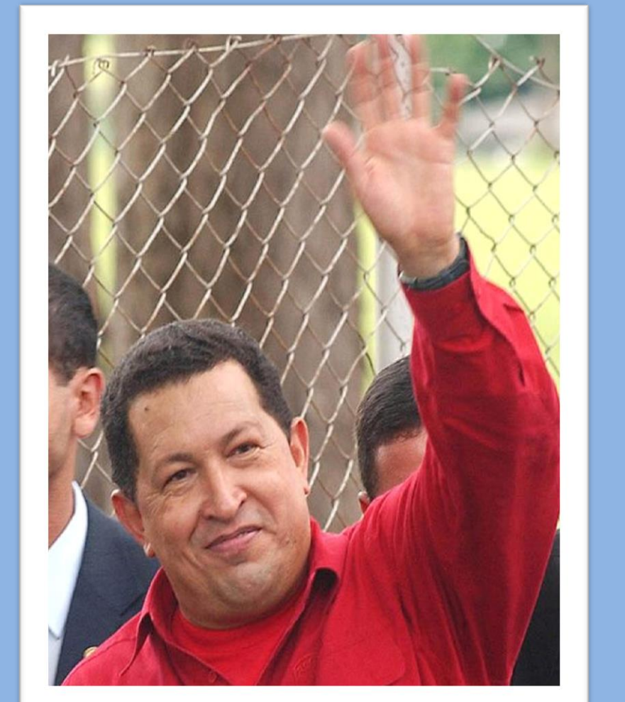
Hugo Chavez President of Venezuela 1999-2013