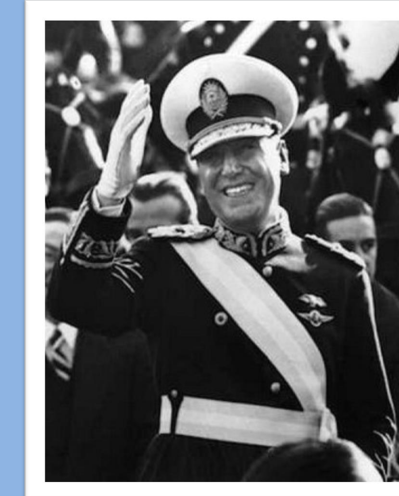
Juan Peron President of Argentina 1946-1955, 1973-1974