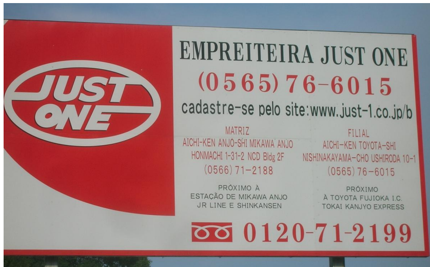
A billboard for a labour company near Homi Danchi, Toyota City

sometimes financing their flights to Japan, and finding factory jobs for their clients. 113 Little or no costs are required in advance for these services, as the fees are collected during the migrants' the first six months of employment, with their passports held as a deposit until full repayment has been made. 114