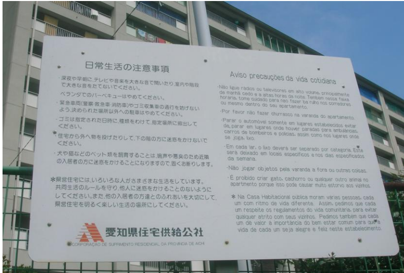
Bilingual sign in Homi Danchi housing complex, Toyota City

Difficulties with the Japanese language further compound the cultural barrier as it is the most apparent struggle for Japanese Brazilians in Japan as most do not speak Japanese fluently and even when they can speak, very few can adequately read or write it. 160 Their poor language skills highlight the fact that they are foreign and not Japanese according to nationals who share the “one Japanese language and culture” mindset. Japanese Brazilians did not meet the expectations of sharing Japanese cultural practices, and their differences from mainstream Japanese society have actually created a schism between the two groups that has resulted in widespread discrimination. 161