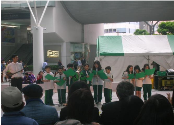
Brazilian nikkeijin students singing at a cultural event in Hamamatsu

The educational realities for Japanese Brazilian children in Japan illustrate that they, like their parents, face a daunting task when living in Japan: as students, they are meant to learn, but given the linguistic hurdles, their development is often compromised. Although children's language acquisition is faster than that of their parents, they experience hardships when enrolled in Japanese schools. 178 Several obstacles to their learning are systematic: Japanese has two alphabets as well as many ideograms that have little relation to European romance languages, which does not help Brazilian students. 179 They may learn to speak Japanese quickly, but their reading and writing skills do not usually become sufficient for basic functioning in Japan. 180 Additionally, migrant children do not have parents who can help them with their studies due to a lack of time, from busy factory work schedules, and an insufficient knowledge of Japanese and the school system. 181