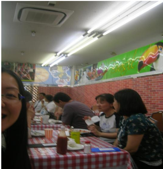
Inside a Brazilian restaurant—Servitu—in Hamamatsu

Prefecture (Toyota and Toyohashi) and Hamamatsu city in Shizuoka Prefecture. 132 As of May 2012, Brazilians comprise the largest group of registered immigrants in Hamamatsu with a population of 12,186 which amounts to almost half of the 25,093 foreigners in the city 133 and in Toyota, they number 5,991, also as the biggest group foreign residents in the city which outweighs the next group by roughly 3,000. 134 Nagoya and areas outside of Tokyo also have considerable nikkeijin presence. 135 Socially, Japanese Brazilian communities in Hamamatsu and Oizumi cities have developed growing ethnic businesses such as restaurants, grocery stores, clothing shops, and nightlife venues along with churches and schools that offer services in Portuguese. 136