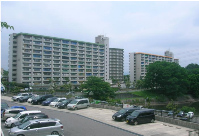
Homi Danchi, where 50% of residents are foreigners

numbers of Japanese Brazilians often live in the same residential areas which are commonly seen as negative due to the growing estrangement between them and core Japanese society. 163 This housing divide is another reason for segregation as it is harder to meet Japanese nationals in their neighbourhoods which also affects language learning and social inclusion. 164 Japanese landlords have been known to refuse to rent to Brazilian nikkeijin as well; and there is no law that prevents housing discrimination or discourages these practices. 165 In effect, the majority of Japanese Brazilians are relegated to living in Brazilian enclaves. 166