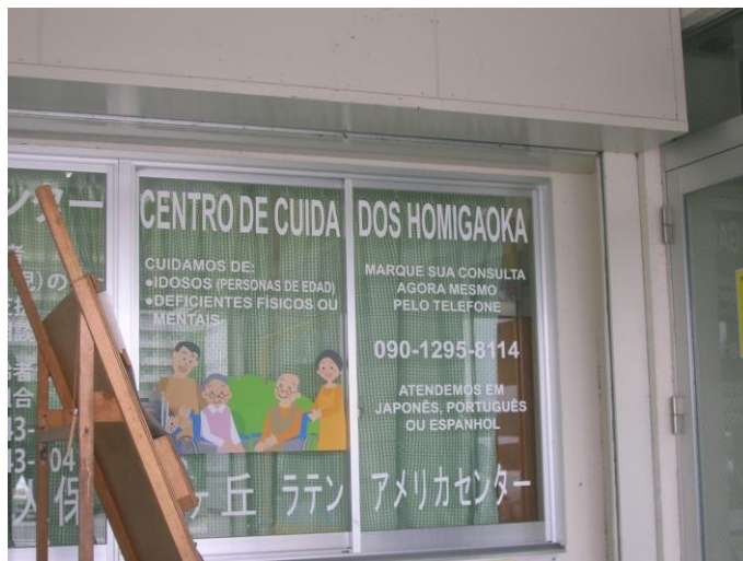
A private Portuguese-language school in Homi Danchi

lost in their other classes and more likely to quit school. 189 The problems to having such a classroom, along with the policy of no grade repeats, are that the students may never catch up on the class curriculum and that they are separated from their Japanese peers who could help with their adjustment to school. Other tactics include hiring Japanese-language tutors to help foreign students individually 190 and also bilingual assistants who meet the children and their parents during school visits within a prefecture. 191 These measures also have been critiqued for the insufficient amount of time or irregularity of the sessions. 192 Moreover, as migrant children are not evenly distributed in Japanese schools, available assistance is ad hoc and varies which prompts one to think that national policies could lead to better solutions.