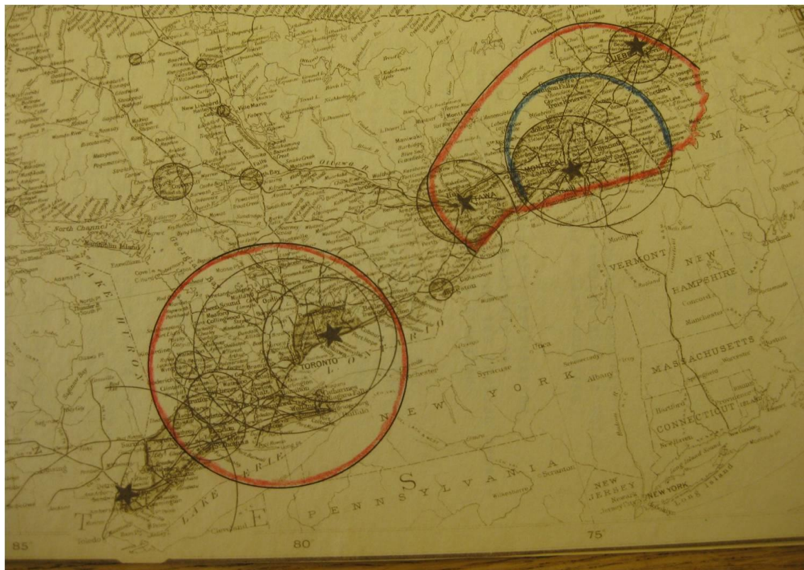
Figure 2 Map showing coverage of new stations in Hornby, ON and Verchères, QC. March 16, 1938.

address from the King as part of a schedule that included programs like The Christmas Stocking from Vancouver, The Animals' Christmas from Banff, and Reindeer Christmas from Toronto. 148 In his comments during the opening, Howe again commented on the corporation's improved programming while also highlighting that even though the station was based in Toronto, it "will draw on all artistic resources of the whole of Ontario." 149