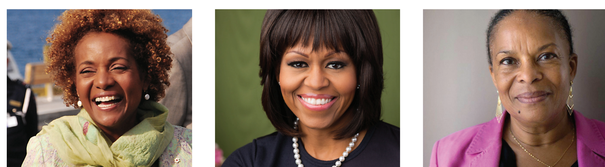
Former Governor General Michaele Jean

This tool will be used to address the limitations of defamation in tort law for racialized women. It will further demonstrate the methodological models of power employed by the operation of the Canadian justice system, the media and elite systems of discourse.