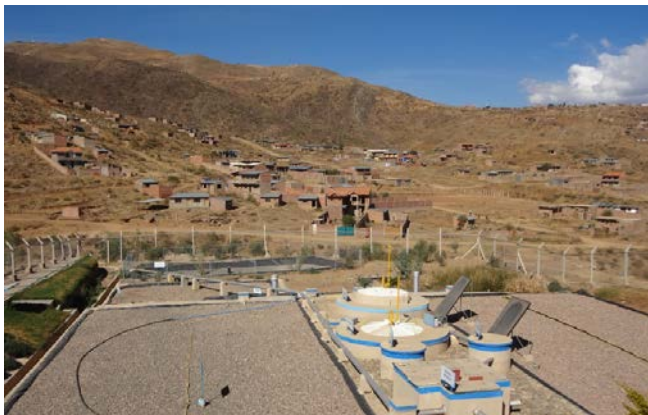
Photo 12: Decentralized waste water treatment plant in Lomas del Pagador

As in much of the southern zone, Lomas residents suffered from a lack of sewerage until recently. The local creek served as a public toilet and was heavily contaminated by wastewater, as were household lots, streets, and ravines in the community. In the best of cases, some households with more resources had septic tanks, but the general level of