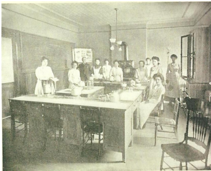
Figure 8. “Domestic Science Kitchen.”

As figure 8, below, reflects the domestic science facilities at the OIED were in top shape. This subject was approached as a scientific and serious endeavor and I suspect that parents viewing this photograph would feel assured that their daughters were learning how to “properly” care for the domestic duties associated with female adulthood.