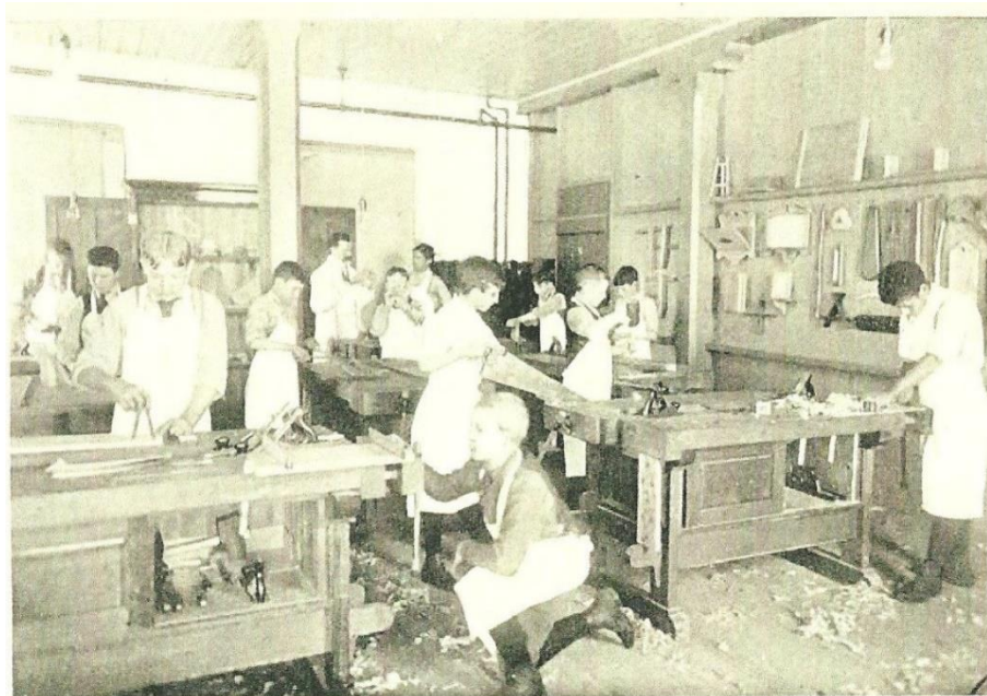
Figure 9. “Manual Training Work Shop.” Thirty-third Annual Report upon the Ontario Institution for the Education of the Deaf and Dumb being for the year ending 30 th September 1903, 29.

In 1898 Mathison considered introducing manual training, based in part on the Swedish Sloyd 129 system, to train for boys who were too young to learn a trade in the regular shops or who were unlikely to pursue a trade. 130 Even if the boys did not follow a trades course, “...their experience in the Manual Training Room will help them materially.” 131 This approach to reach the younger boys would ensure that even those who did not learn a trade would be inculcated with those “good” work habits that would help them attain “good” citizenship values of employability. The program began in 1901 and the administration claimed to be, “...pioneers of this work in Ontario.” 132 As figure 9 below reflects, the manual training workshop was well equipped to lay the foundation of basic carpentry skills. The students in the image are intent on the various tasks at hand and reflect the notion of hard work and diligence that were key aspects of normative masculinity and “good” citizenship.