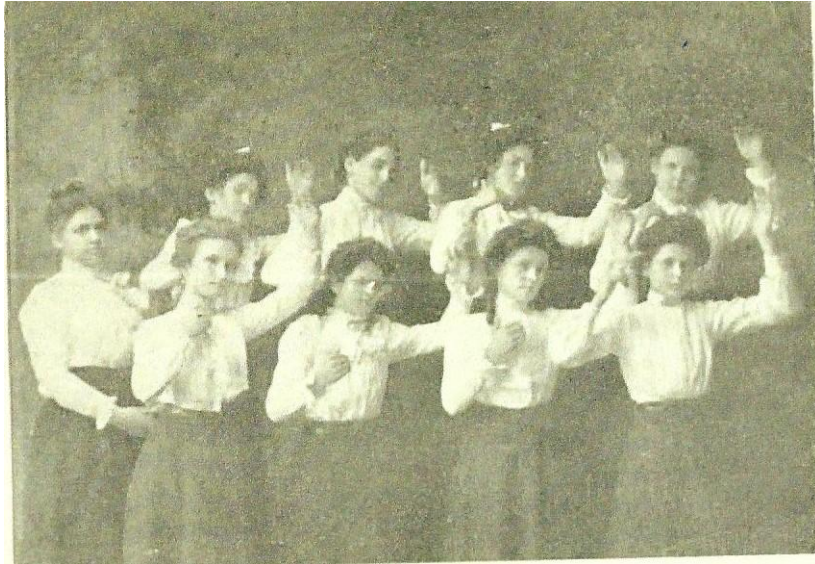
Figure 2. “Deaf-Mute Girls Signing ‘Nearer My God to Thee’ at the Institution” Thirty-Second Annual Report upon the Ontario Institution for the Education of the Deaf and Dumb, Belleville, being for the year ending 30 th September, 1902, 23.

Understanding the role the combined system, specifically sign language, played at the OIED during this period was a useful way to explore ideas around language and citizenship in the early years of d/Deaf citizenship education at the OIED. During this period, sign language was not seen as a detractor from national citizenship but was used in the classroom and daily life, as a means to facilitate communication between the hearing and the d/Deaf and as a vehicle to engage in conversations about national citizenship. As we shall see, the role of sign language would take an increasingly diminished role in OIED life as the second phase of citizenship education, “spoken” citizenship began.