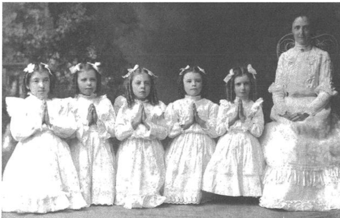
Figure 1. “Little Deaf-Mute Girls Signing ‘Now I Lay Me Down to Sleep,’ at the Institution.” Thirty-Second Annual Report upon the Ontario Institution for the Education of the Deaf and Dumb, Belleville, being for the year ending 30 th September 1902, 27.

caption: “Little Deaf-Mute Girls Signing “Now I lay me Down to Sleep”, emphasizes the message – these are “good” Christian girls.