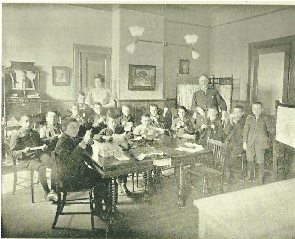
Figure 7. “Class of Small Boys in Sewing.”

December of 1893 indicating that she had found work in a print shop. 69 However, the “Home News” column of the same edition indicates, “There are no girls learning typesetting in the printing office this term.” 70 Indeed, no female pupil would occupy a spot in the printing office at the OIED again between 1893 and 1914, but the significance of these two young women should not be overlooked. While the trades curriculum at the OIED followed gendered lines, perhaps because of smaller class numbers, it broke with gendered constructions when it was expedient to do so.