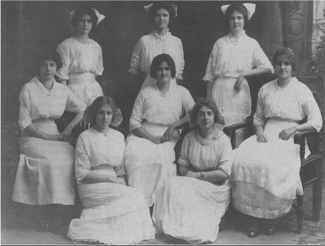
Figure 6. First Graduating Class of the OIED, 1913-1914 Report of the Ministry of Education of Ontario for the year 1914