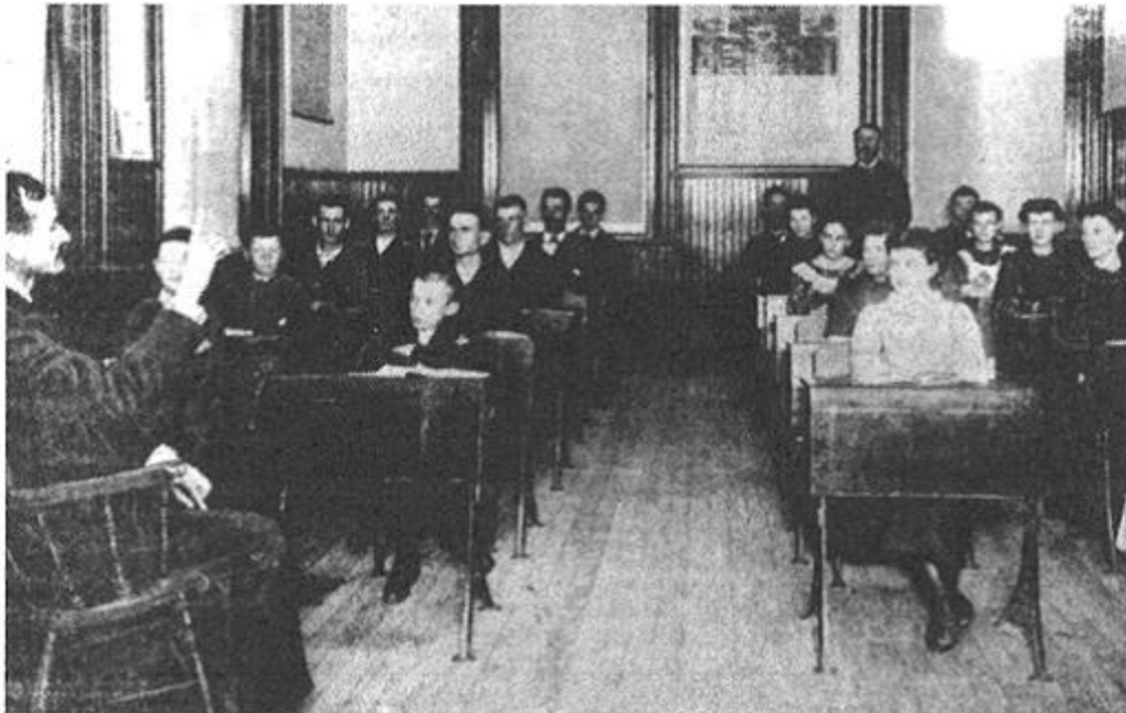
Figure 5. “A School Room – One of Fourteen.”

Twenty-Fifth Annual Report of the Inspector of Prisons and Public Charities upon the Ontario Institution for the Education of the Deaf and Dumb, Belleville, Being for the year ending 30 th September 1895,” 15.