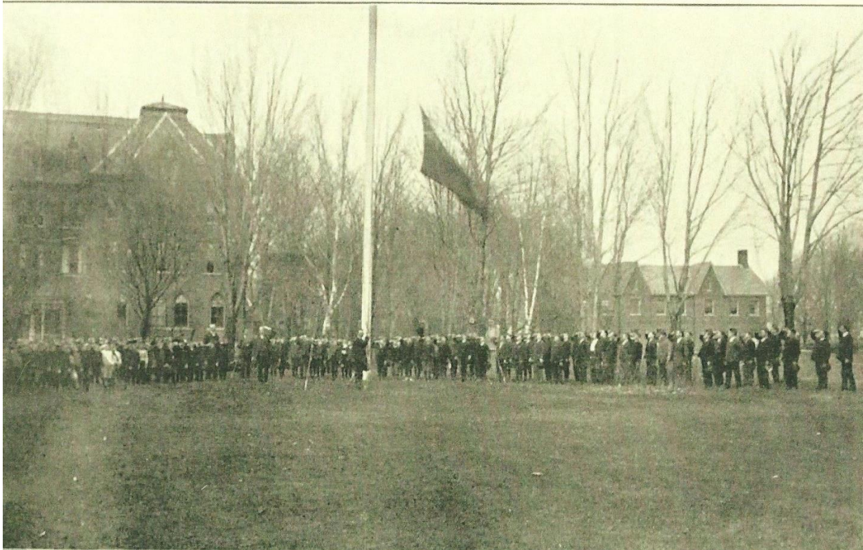
Figure 4. “Raising the Flag.” Report of the Ministry of Education of Ontario for the year 1907 , 496.

The secondary literature on the history of d/Deaf education and d/Deaf culture has placed a lot of emphasis on the debate between best practices and d/Deaf education. Manualists and oralists both felt strongly about their political, pedagogical and ideological positions. Taking the “debate” to the level of the classroom, playground and living quarters, often through the lens of school documents that both the students and parents consumed, allows me to see how the debate played out in the lives of the students.