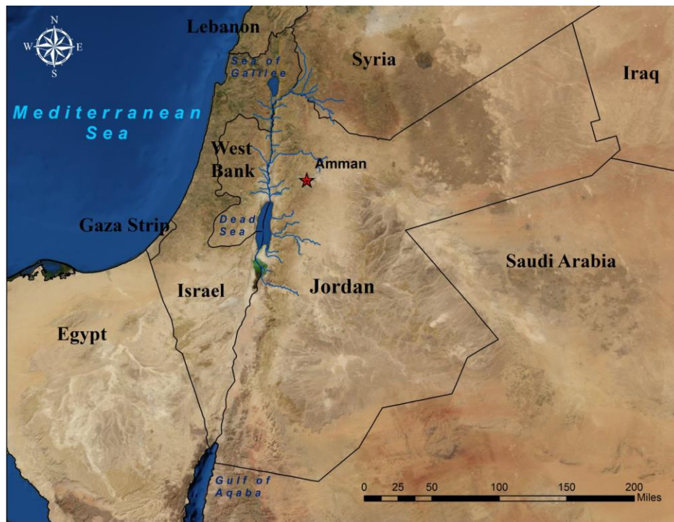
Figure 1: Map of Jordan

Jordan has an altitude between -400 m at the Dead Sea surface (lowest point on earth) and 1,750 m at Jebel Rum. It has three different bioclimatic zones. The first zone is Jordan valley, it is a narrow strip located in the western part of the country at the border between Jordan and Palestine; it is below mean sea level and characterized by warm winters and hot summers. Also, this zone is an agricultural area