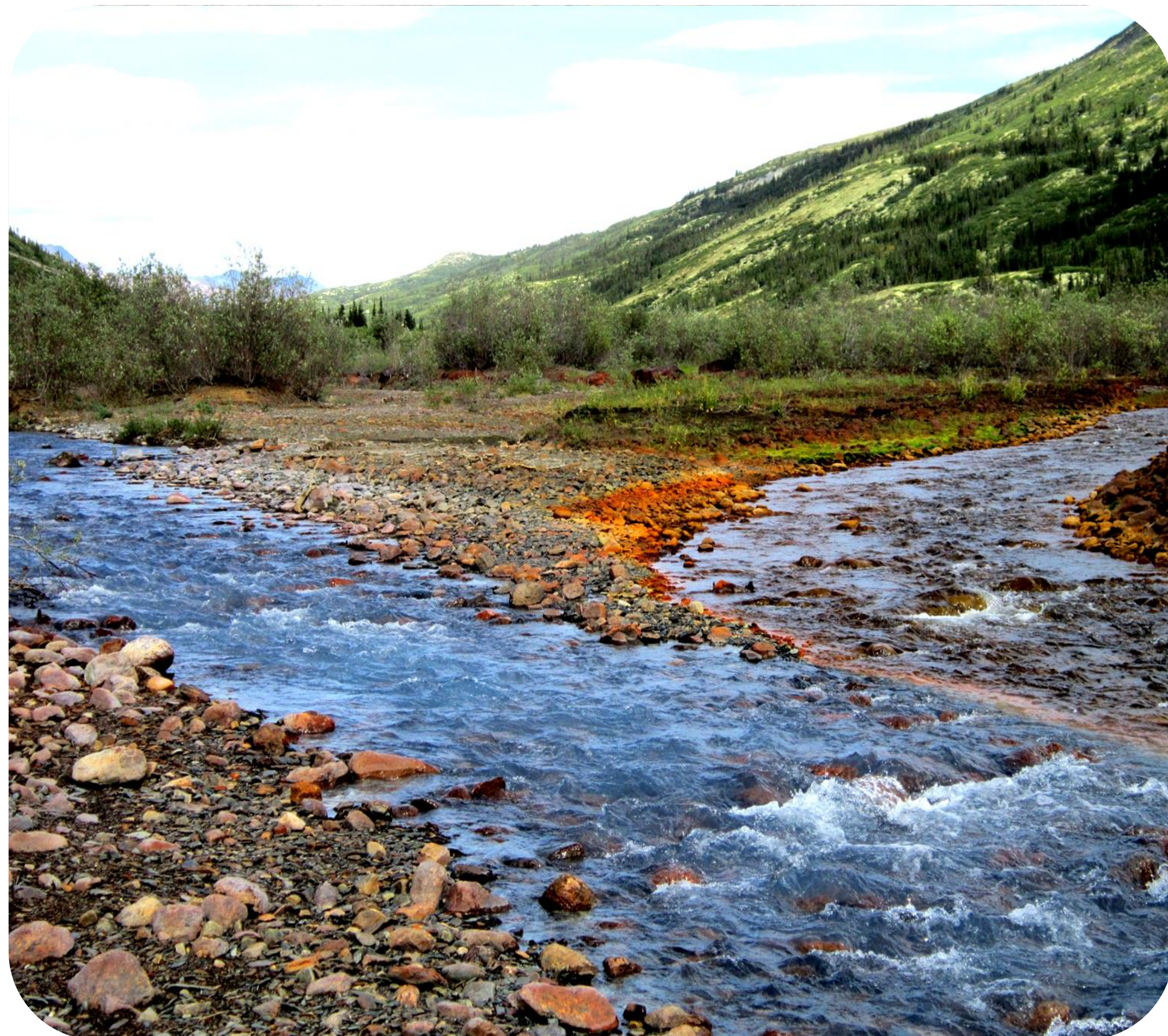
Picture 1. Two rivers merging of basic (left) and acidic (right) pH, easily distinguishable by colour differences.

Geochemical exploration uses measures of metal concentration and sampling of water and solid phase samples (e.g. soils, tills, stream sediments, etc.) to find anomalous values for the metal or commodity of interest. These anomalies can indicate the dispersion haloes of economically viable ore deposits, and therefore provide an indication of which areas deserve further (and more expensive) exploration. This study explores the ability of equilibrium thermodynamic modeling and mineral exploration to better interpret geochemical data. However, chemical weathering, aqueous transport of detrital sediments, and precipitation of secondary minerals are not accounted for in present literature. The determination of metal content within samples taken from mineralized streams running over the Tom and Jason deposits in the MacMillan Pass area of the Yukon Territory, geologic trends will be explored. Furthermore, aqueous geochemistry techniques will be used for the analysis of bulk chemistry, speciation ( Fe^{2+}/Fe^{3+} ) and morphological characterization of the metal-rich particulate material of the streams for later modelling inputs including the use of the Dionex 600. This research should improve our understanding of metal speciation and mobility in natural aqueous environments, with the goal of refining current exploration methods and extending them to deeply buried ore deposits using equilibrium thermodynamic modeling methods.