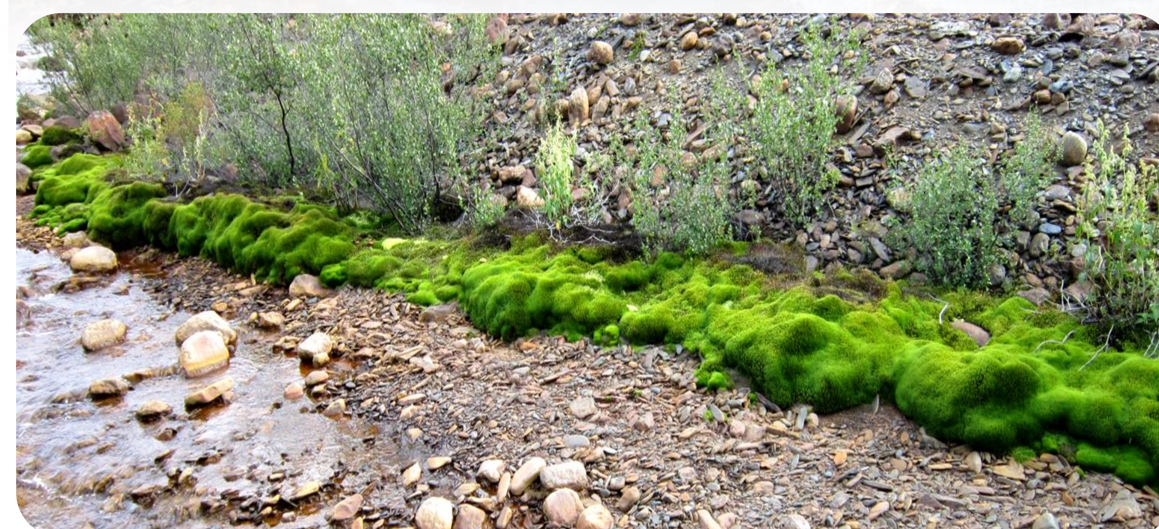
Picture 2. Commonly known as “zinc moss”, this vegetation demonstrates a novel environment, even in extreme conditions.