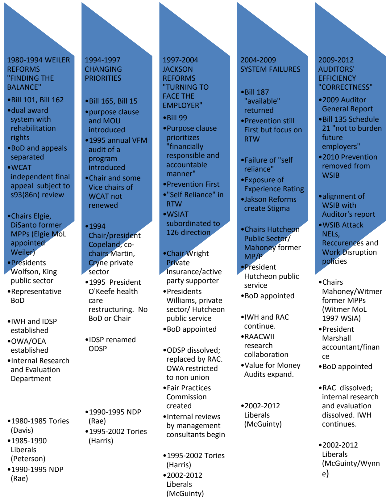
Figure 1: Reform Timeline