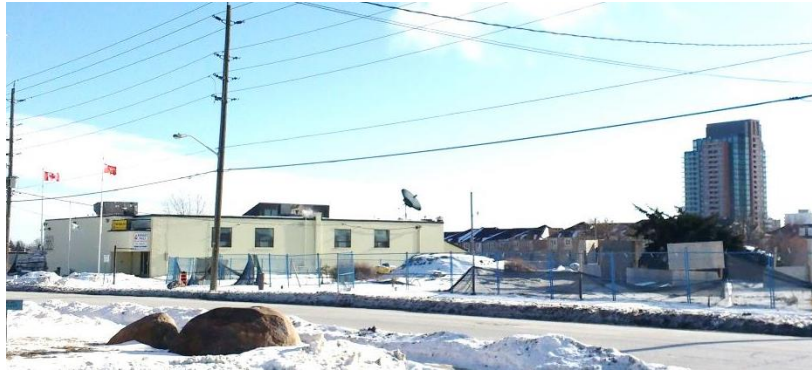
Figure 7: The Royal Canadian Legion, Ajax Branch, and a vacant adjacent lot, viewed from Hunt St. Photograph by author, January 2018.

Figure 7 is interesting for the way it depicts the situation of postwar culture in the economic context of renewed primitive accumulation. The legion hall stands adjacent to a vacant lot—formerly devoted to industrial use—that has been fenced off for high-density residential development. In the background, two relatively new residential developments are visible. The houses behind the legion were built about a decade ago on land that had previously housed industrial users in old D.I.L. buildings. Behind them, the tower of Pat Bayly Square is currently under construction at the time of writing. It appears that an overheated housing market is causing residential land use to trump industrial use. Building houses is the top way to ‘improve’ the land, so much so that Ajax, like much of Scarborough, is beginning to expand upwards.