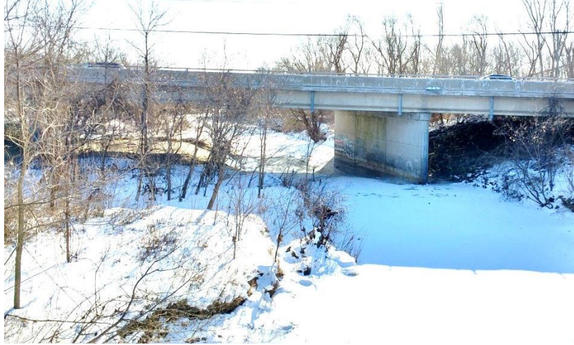
Figure 6: Kingston Road (Highway 2) crossing Duffins Creek at Pickering Village, viewed from the north. Photograph by author, January 2018.

The appearance of Duffins Creek in Figure 6 illustrates this new relationship. The photograph was taken near the site of a 19 th -century mill which has disappeared. Waterways like Duffins Creek were originally central features of the landscape, first as transportation routes for indigenous peoples, next as settlers' access routes to the interior. Duffins Creek played an important role in the early settler economy by powering mills. In the postwar relationship with the land, Duffins Creek is an afterthought, an obstacle crossed by major arterial roads like Highway 2.