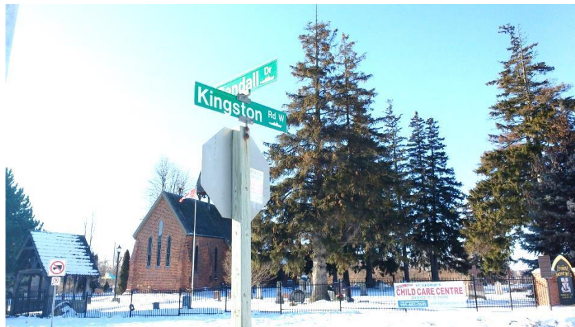
Figure 4: St. George’s Anglican Church in Pickering Village, today part of Ajax. Note the Canadian flag flying in the yard, and the location on the historic road to Kingston. Photograph by author, January 2018.

The built environment in Durham Region continues to bear subtly witness to another dimension of Simcoe’s project: the ideological. Upper Canada played host early on to an internal war and a war of subjectivities. For Alliez and Lazzarato, imperialism is closely related to a “guerre intérieure” of elites against the population. An historical dimension of this war has been “guerres de subjectivité”, in which elites have used tools such as religion and misogyny to subject individual behaviour to greater and greater degrees of control. 72