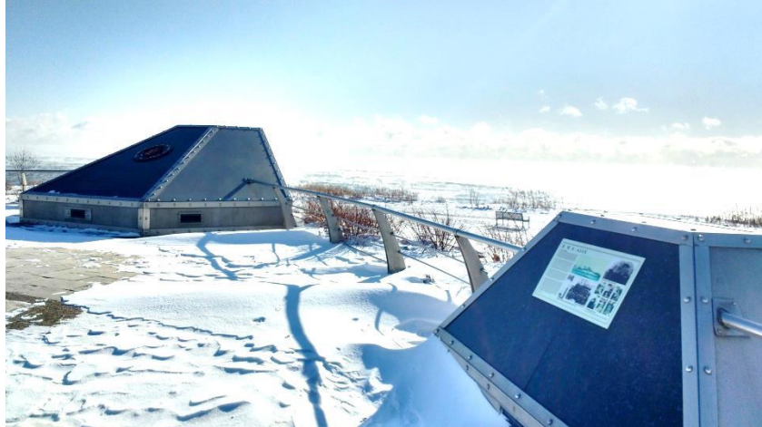
Figure 8: Veterans' Point Gardens, imitating the warship HMS Ajax, at the foot of Harwood Avenue. Photograph by author, January 2018.

Figure 8 shows the symbolic prow of a British warship facing out into what the Wendat first called ontari'io , or “Lake of Shining Waters”. 85 Here Lake Ontario is more of a stand-in for the South Atlantic, commemorating the exploits of British sailors. Plaques tell the story of D.I.L. and the resultant growth of the new community. Little of the darkness or absurdity of war comes through in Ajax’s public memory. Though violence is not missed, war is honoured as the generative principle of this society. The positioning of Veterans’ Point Gardens, facing outward from the foot of Ajax’s main north-south arterial road, makes it seem as if the entire town were a warship. Composed of rectangular lots and uniform suburban streets, HMS Ajax steams forward toward progress.