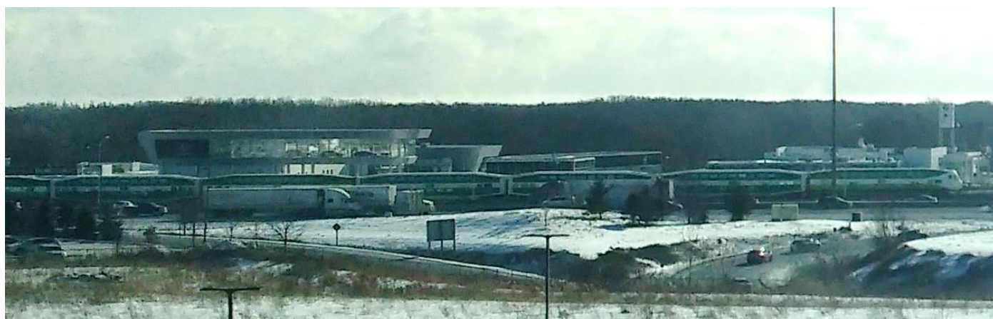
Figure 3: Highway 401 and CN rail corridor viewed from the top floor of a chain fitness club in Ajax, Ontario, looking south. Lake Ontario lies just beyond the trees, at a distance of about 4 km.

If we use Creighton's terminology, Simcoe was fighting to build the commercial empire of the St. Lawrence. The early building of Upper Canada was part of a counter-offensive, and this counter-offensive was part of the same struggle between economies that had exploded in the 1750s. The province's "eventual predominance" must be understood in economic terms. Later development projects such as the Welland Canal sought to improve the St. Lawrence route in competition with the Mohawk-Hudson route on the New York side. 71