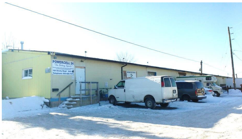
Figure 4: The only remaining former D.I.L. assembly line building in Ajax, now subdivided for use by several light-industrial tenants. Photograph by author, January 2018.

Several aspects of this history bear a closer look. First, the Canadian state—indeed the executive—basically created an entire town as part of the industrial war effort, and set that town on a path of liberal suburban development after the war. To live in Ajax today is to tread that path which was launched between 1940 and 1945. Here is a remarkable instance of the state playing an integral role in the material reproduction of society by not only integrating itself into economic circuits, but radically laying the groundwork for a new kind of economy and society. Describing a related process in Verdun, Québec, in which the government converted wartime industrial infrastructure for peacetime use, historian Serge Durflinger tellingly describes the postwar economic development strategy as “making wartime continue”. 83 This war was not against Germany, but against the possibility of fundamental changes to the social order.