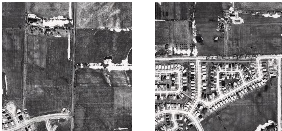
Figure 5: Suburban housing development rises on the Simcoe-era concession grid in Scarborough, Ontario in 1960.

amounted to a new phase of primitive accumulation on the lands of the Mississauga and the Haudenosaunee.