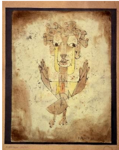
Figure 1: Paul Klee, Angelus Novus (monoprint, 1920). Discussed by Benjamin in “Le concept d’histoire,” Essais III (Paris: Gallimard, 2000).

In taking stock of my surroundings and their past, I have been reminded in some sense of Walter Benjamin's angel of history, borne by the wind ceaselessly into the future, but gazing wildly back on the growing destruction termed progress. 54