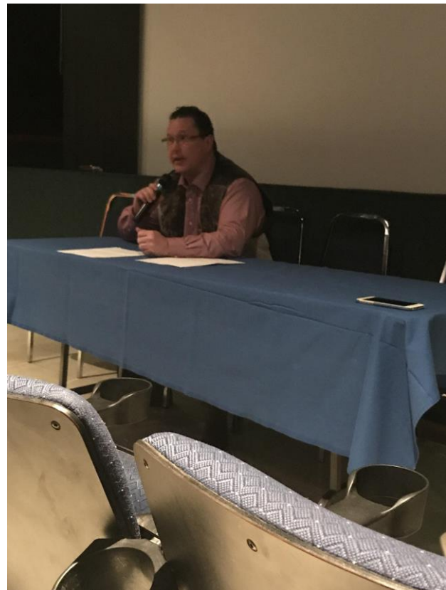
Iqaluit (NU) - Remarks by Minister George Hickes of the Nunavut Legislative Assembly. Listen to the audio archive here.