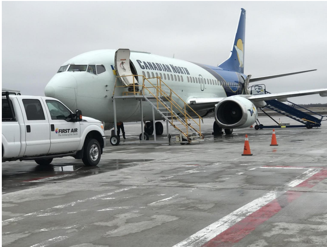
IQALUIT (NU) - Collaborator, Geneviève boards a plane in Ottawa, headed to Iqaluit, Nunavut on April 11th, 2017