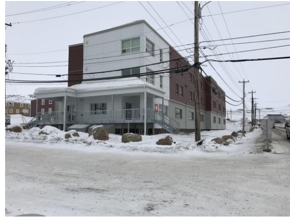
Iqaluit (NU) - North Mart (top left), St. Jude's Cathedral (top right), Nakasuk School (bottom left) and CBC North Iqaluit (bottom right)