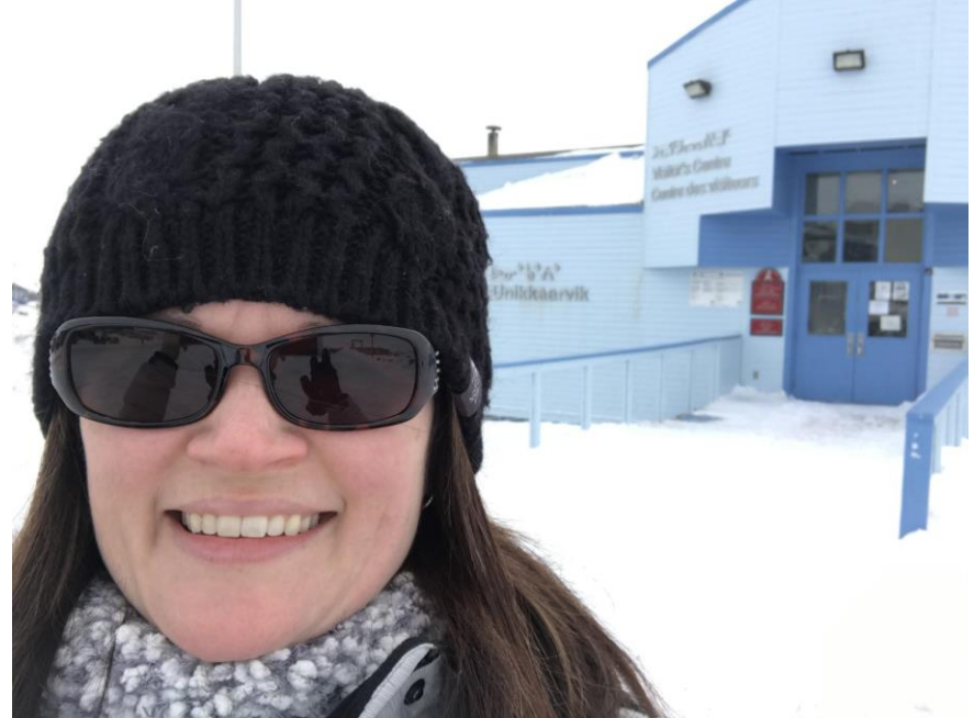
Iqaluit (NU) - View of Frobisher Bay (left), and Visitors' Centre (right)