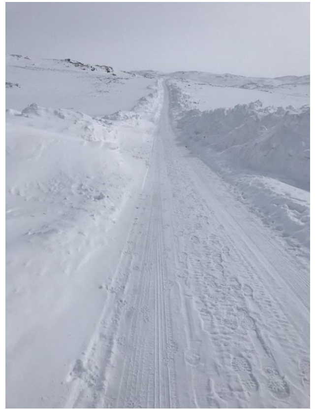
Iqaluit (NU) - The 'Road to Nowhere'