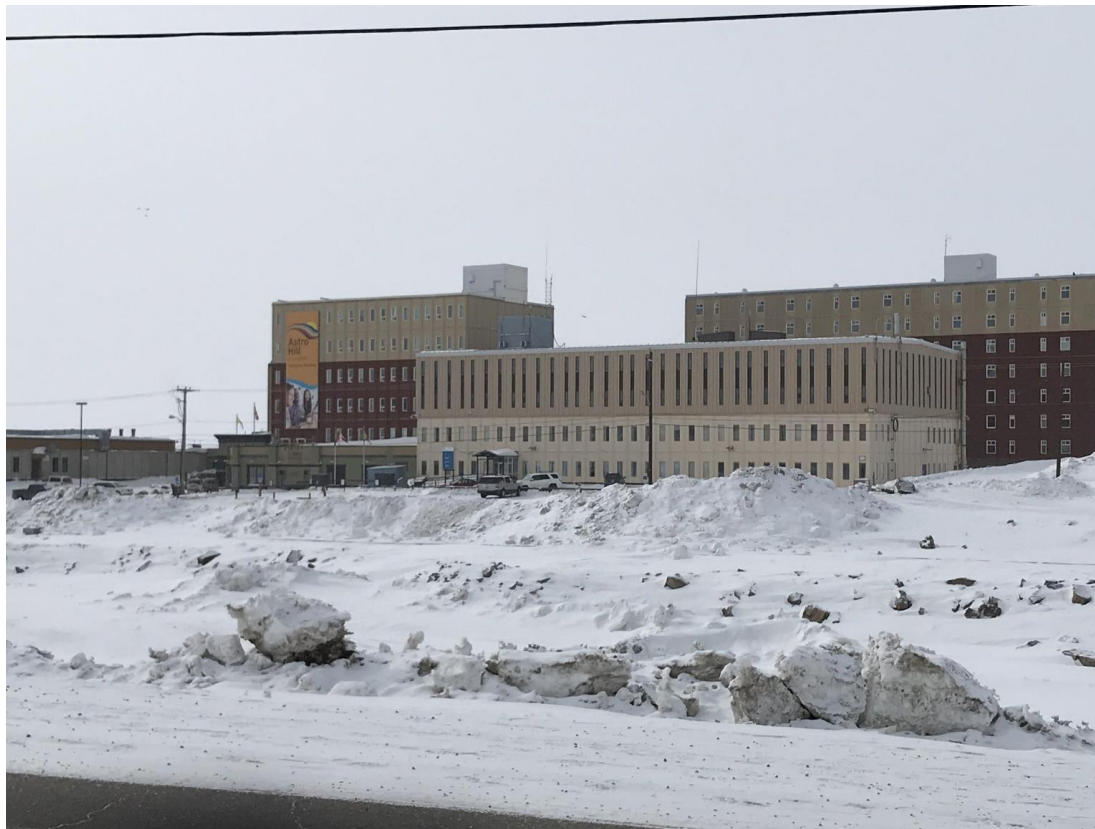
Iqaluit (NU) - Iqaluit Hospital