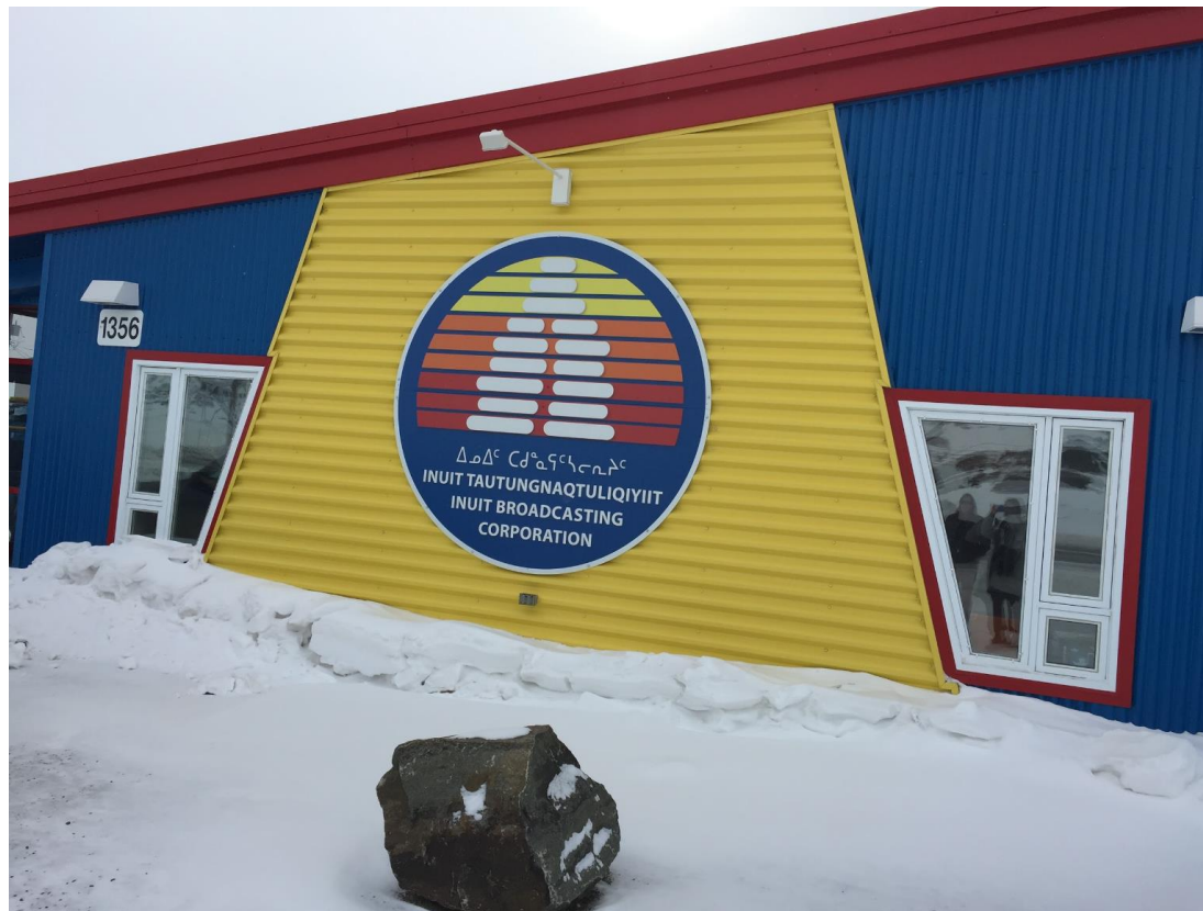
Iqaluit (NU) - Visit to the Inuit Broadcasting Corporation Offices in Iqaluit.