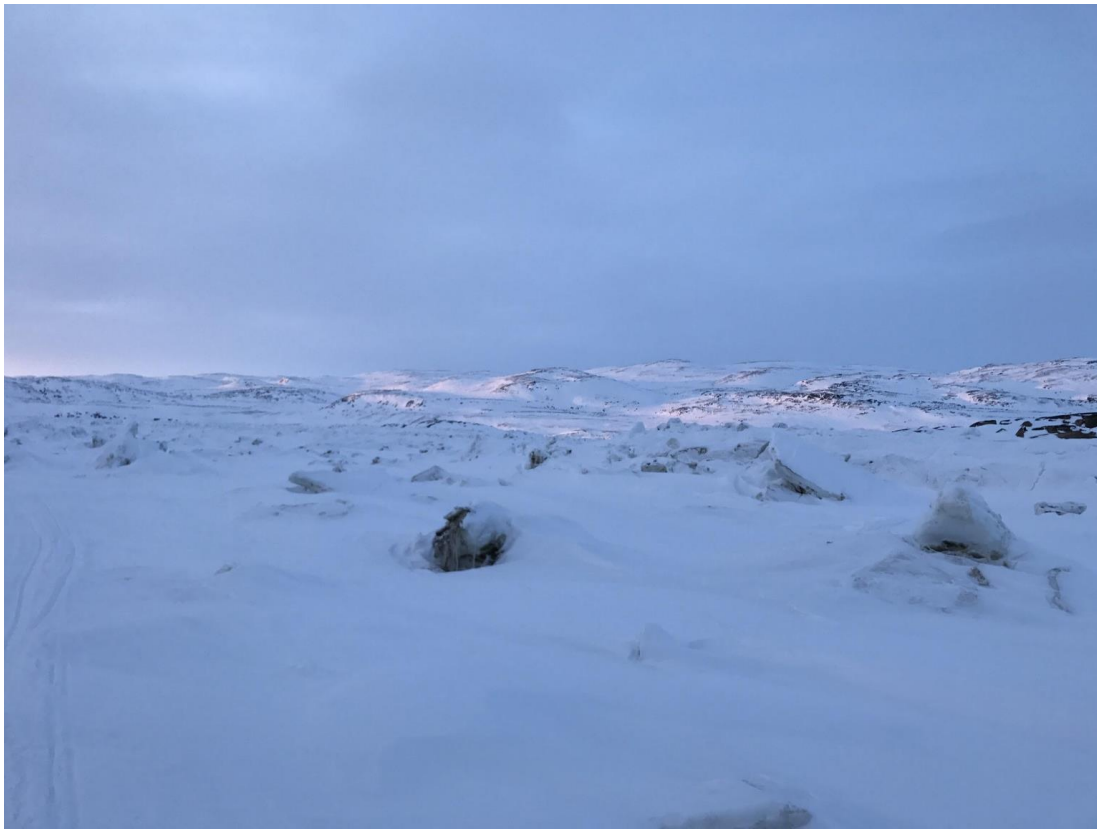
Iqaluit (NU) - Sunlight on the tundra.