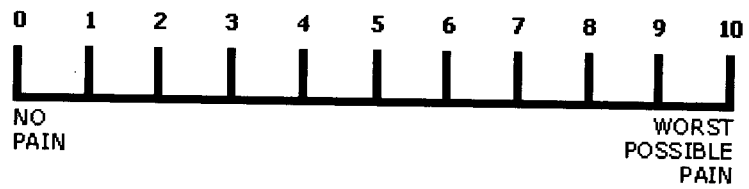
Figure 2. Pain Scale: Numerical Pain Scale 0-10.