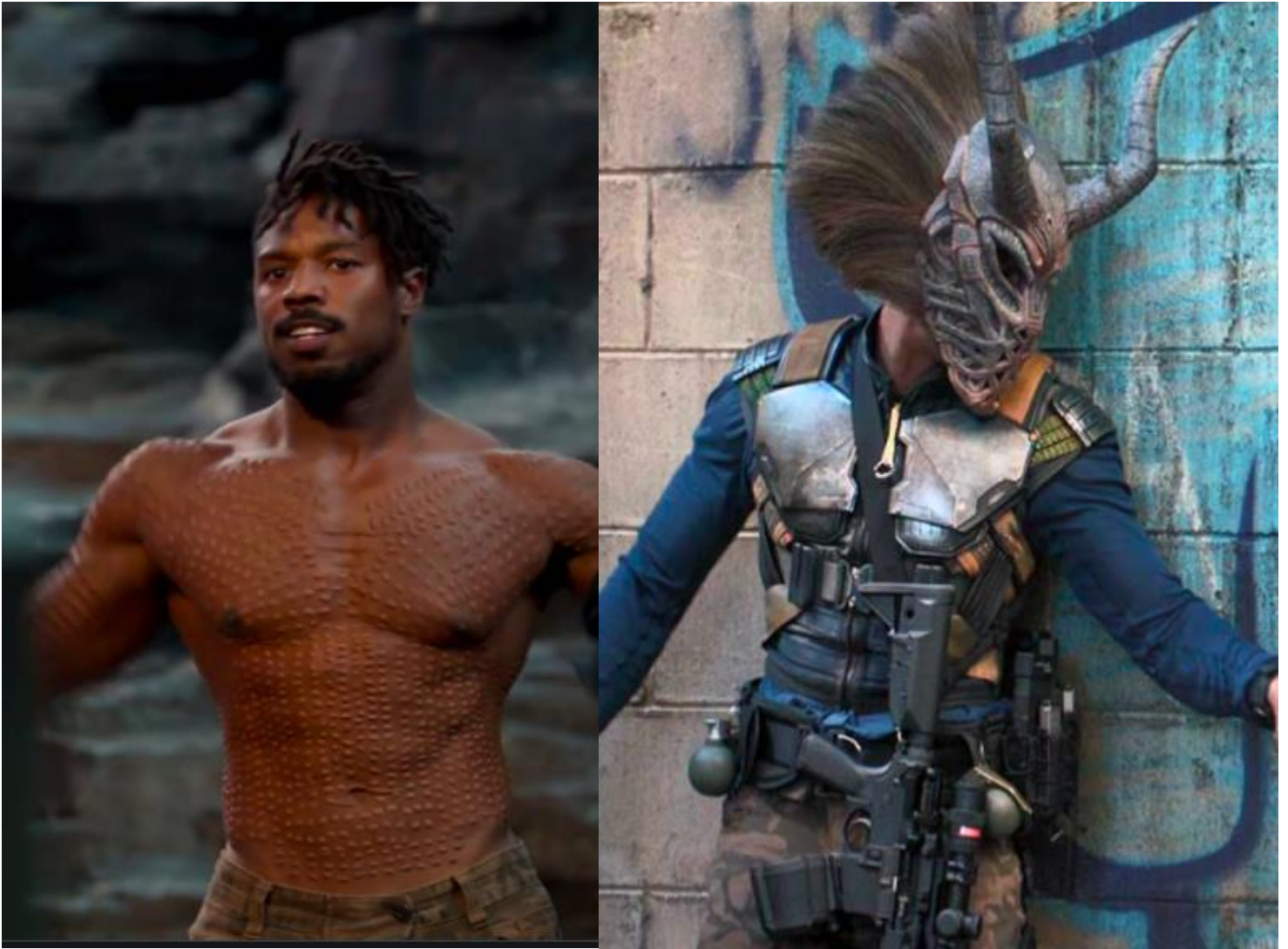
Figure 8: Killmonger (Michael B. Jordan) further portraying scarification practices on the right, and on the left, wearing an Igbo mask.