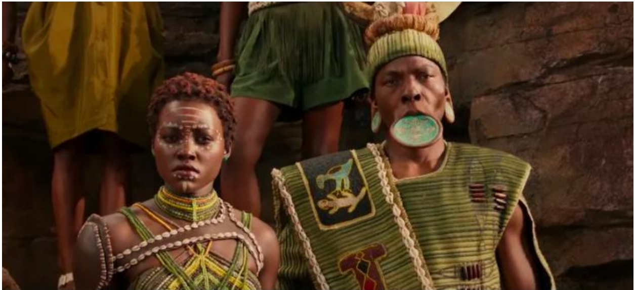
Figure 3: Nakia (Lupita Nyong'o) wearing Xhosa-inspired tribal face paint and the River Tribe Elder (Isaach de Bankolé) sporting ceremonial lip and ear plates, a practice for which the Ethiopian Mursi tribe is known.