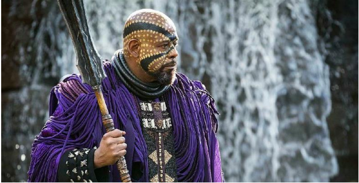
Figure 6: Zuri (Forest Whitaker) wearing an ornamental robe, inspired by the agbada worn in West Africa. Zuri’s face is also painted to mimic the practices of the Xhosa tribes in South Africa.