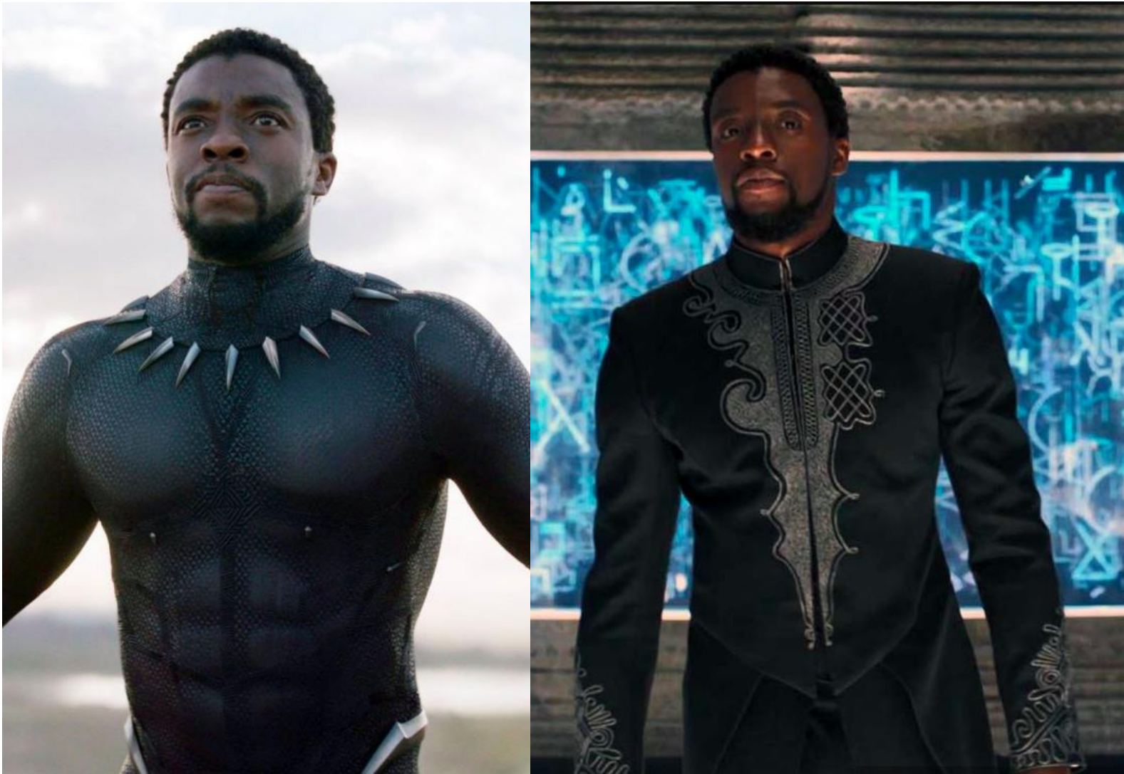
Figure 1: T'Challa (Chadwick Boseman) wearing a formal dashiki-inspired suit on the left and the Black Panther suit, designed with an Okavango pattern, on the right.