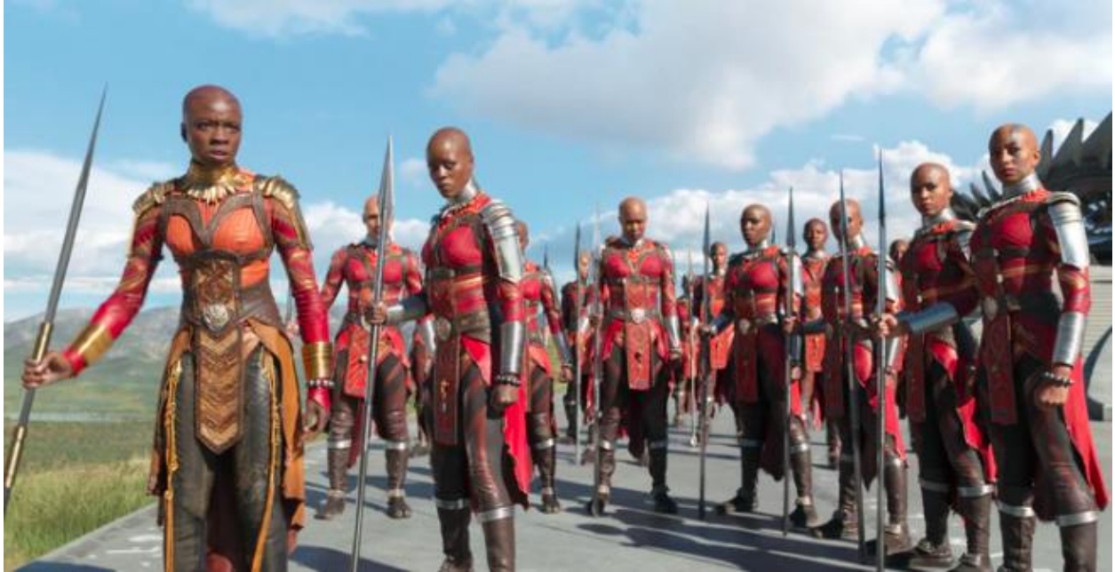
Figure 2: Okoye (Danai Gurira) and the Dora Milaje, dressed in battle gear inspired by the real-life Dahomey Amazons, a group of female warriors from the Kingdom of Dahomey.