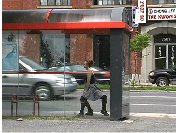
Fig. 2. Still of Kinga Araya performing “Grounded,” Mythogeography , www.mythogeography.com/kinga-araya-s-ten-steps-walking-in-circles.html .

psychological burdens that prevent the self from flourishing (35). I expand this notion by arguing that the extra limb, which renders her highly visible, is not simply an outward manifestation of a vague existential dread but an expression of how Araya feels often grotesque or strange specifically as a female immigrant. In PolCan , 2002 (see fig. 3)—a title that signifies her double identity as Canadian and Polish—she wears round red and white spheres on her feet that have a large spike on the bottom so that her footwear resembles spinning tops rather than shoes. Decked out in a red and white costume (the national colours of Canada and Poland), she proceeds to walk accompanied by both the Canadian and Polish national anthems, slowed down to a pace that can accommodate the rhythm of her awkward, precarious steps, a symbolic teetering between identity categories (Araya, “Walking the Wall” 72).