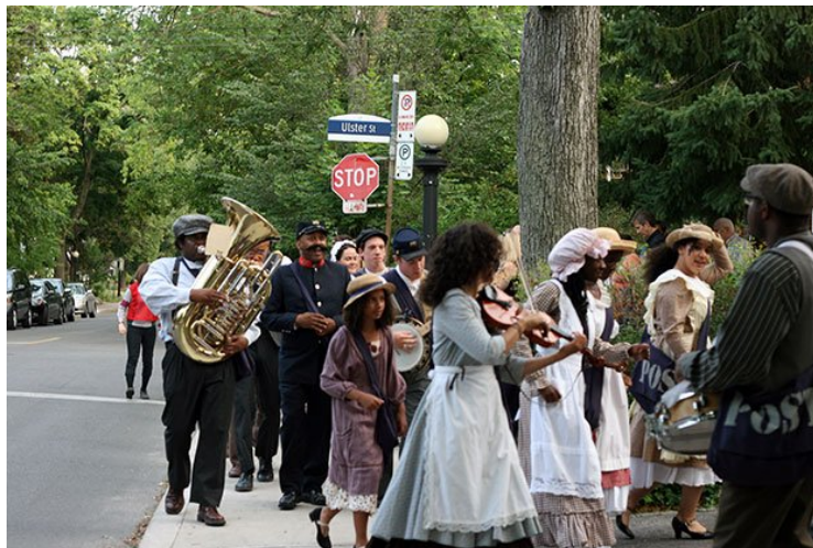
Fig. 8. Brissenden, Neiland. Photograph of a performance of The Postman, Now Magazine , 2015, www.nowtoronto.com/stage/theatre/review-the-postman/ .

the same time, in recalling the lost story of Albert Jackson who struggled against racism as the first black mail carrier in Canada, the street performance enables memorial continuity so that the walkers/audience, whether black or non-black, can reflect on and act on the racism that still circulates in present-day Toronto.