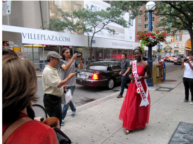
Fig. 5. Dupont, Emily. "Miss Canadiana walking towards Liss Gallery, 2012." Gallery Bespoke , 2012, www.gallerybespoke.blogspot.pt/2012/09/19-follow-ice-cream-truck-for-miss.html .

of red and white, she sported a floor-length red dress, glittering crown and a white sash declaring her title as a national beauty contestant winner as she walked around Ottawa waving a Canadian