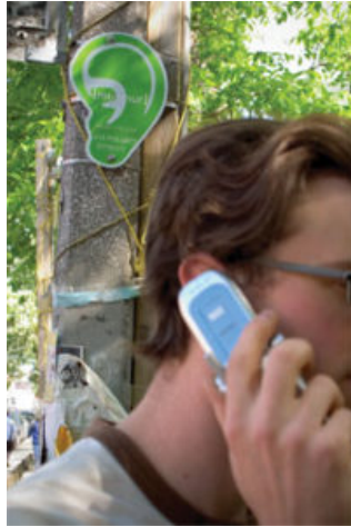
Fig. 7. Photograph of a pedestrian accessing [murmur] , About [Murmur] , www.murmurtoronto.ca/about.php/ .

their voices drawing the walker into the intimate space of personal remembrance. The popularity of the project grew and spread from the Kensington market neighbourhood in 2003 to other Toronto neighbourhoods as well as other cities in Canada and around the world. Recalling de Certeau's conception of walking as an embodied, relational practice, the project's creators describe [murmur] as