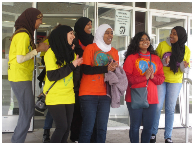
Fig. 11. Russo, Christina. Photograph of Hillcrest high school students leading their walk.

including the importance of the school as a safe, inclusive place for all students (see fig. 11). In these and other walks that I have participated in, I experienced the city differently: the walks revealed the city’s diversity, fostered awareness, invited discussions, and demanded respect for both the city and its many inhabitants. Ultimately, the walker is not a trope, as Walter Benjamin’s flâneur has often been called, or an abstraction, but a living, breathing, located body with