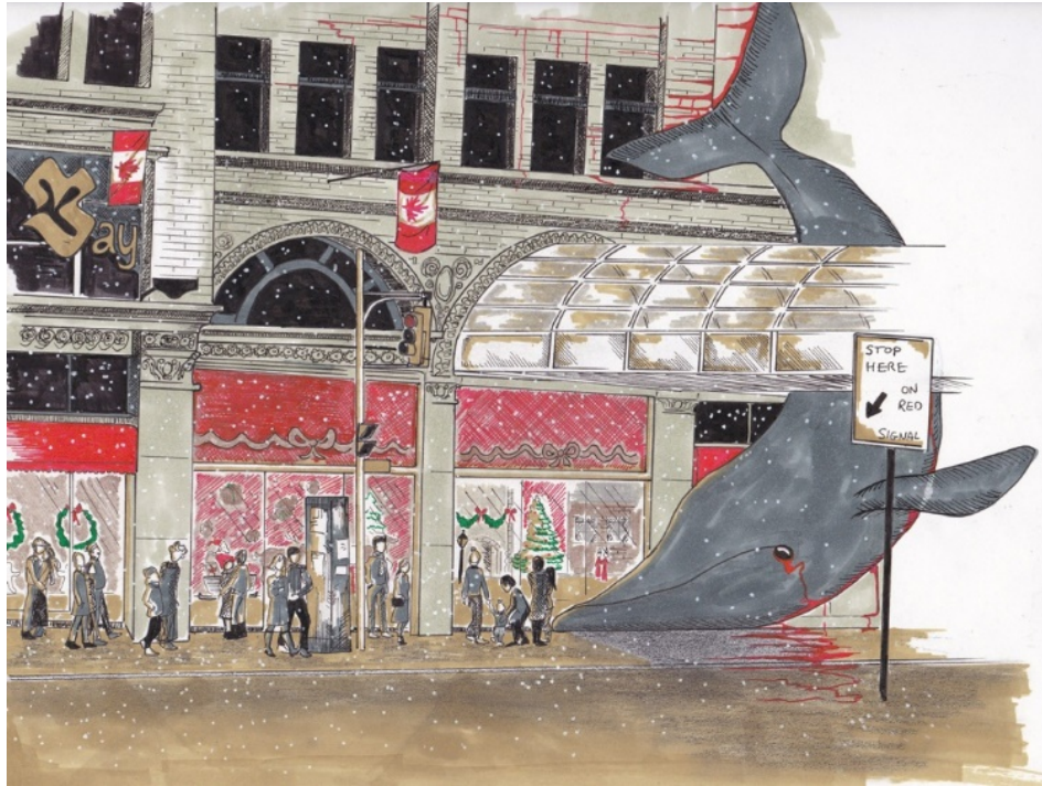
Figure 7: Drawing 4 – Hudson's Bay

During transition period, I felt more depressed and estranged in the winter months, especially around the holidays. This depression and estrangement, of course, was amplified by an overdose presentation of signifiers of the holidays in Canada. The whale's explicit despair here among Christmas shoppers, however, is not a cry for joining the collective of Holidays' celebrations or to resist it: she is impervious, disturbed, and subconsciously continues an urge to break with the structure.