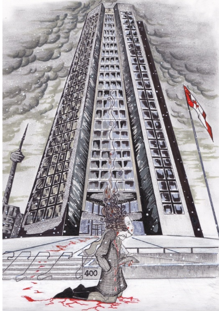
Figure 4: Drawing 1 – 400 Univ. Ave.

This drawing shows me kneeling in front of Zurich building, No. 400 University Ave., which is where I had handed in my application for the Provincial Nominee Program (CIC, 2012b) as a part of the preparation for the federal immigration process. The vision for the drawing comes from the day I made my way to this building to deliver my hand-made birthday card to an immigration officer whom I had met at the University of Windsor. This trip essentially marked the conclusion of my interactions with him. The fact that we never met that day, or any other day, could simply be described as an indiscriminate failed romantic endeavor. But in this drawing, the abhorrently industrial background, the building ‘looking-down’ on me, with the CN