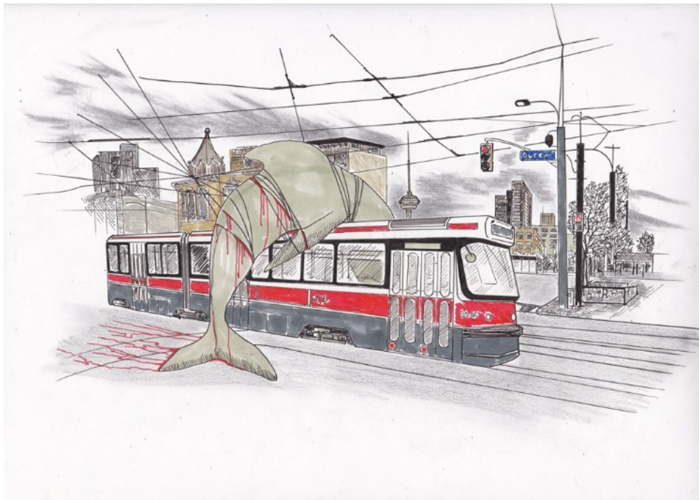
Figure 6: Drawing 3 – Queen at Spadina

This drawing is related to the role of the host state in inducing suffering (Hron, 2009, p. 54), specifically through temporariness as subsequent to PGWPP's conditions. PGWPP defined me as a temporary resident who could not use immigration employment services and was not allowed to register into any degree program either. Thus, a feeling of entrapment, or what in social sciences referred to as social immobility (e.g. Urry, 2007), was prevalent in my sensory experience.