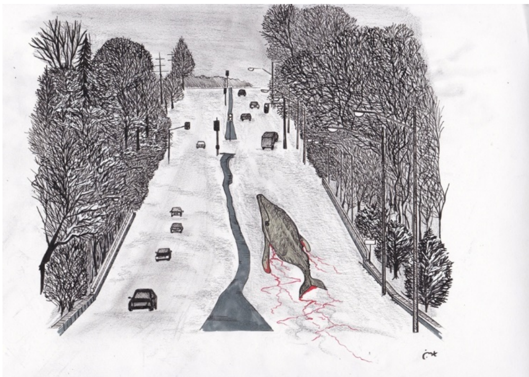
Figure 5: Drawing 2 – York Mills Road