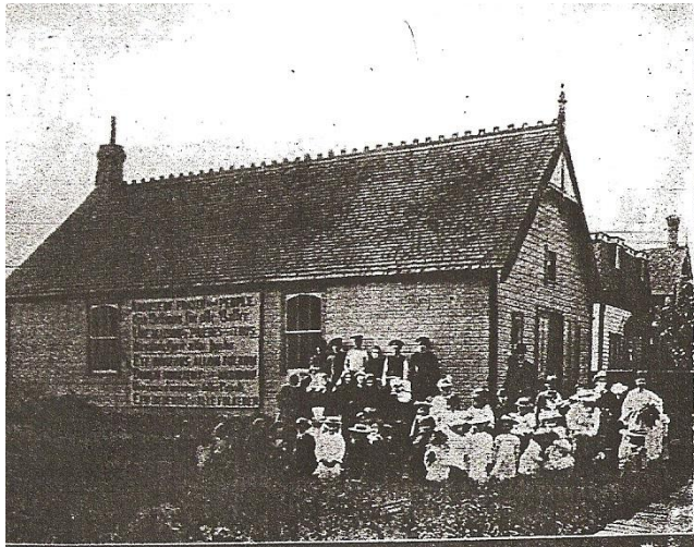
(Figure 4 - Maple Street Branch)

much: in its modesty rather than its beauty and sweetness.” 24 It also featured, on one side, a mural that identified it as a place open to all people; welcome was written in large lettering in more than eight languages. The namesake of All Peoples’ came from a religious passage, that Woodsworth was very familiar with, “My house shall be called a house of prayer for all people.” 25