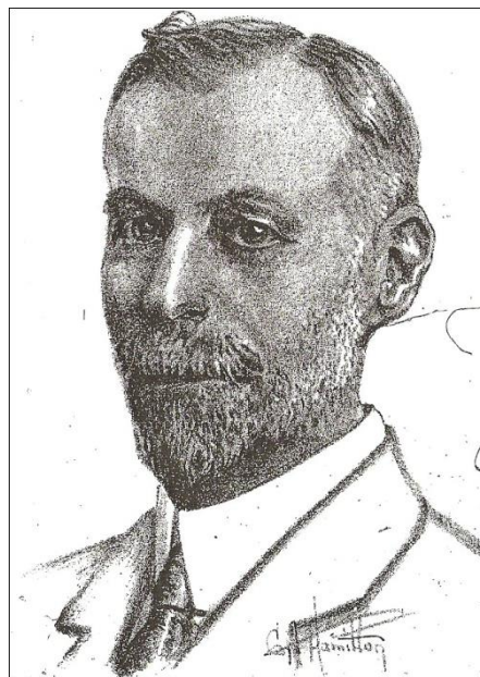
(Figure 1 – James Shaver Woodsworth)

into the man that became a leader and a father of Canada. The Woodsworth myth relies on their interpretation of the All Peoples' Mission to be correct. Historically, Woodsworth would have had to develop a cutting edge social welfare system that incorporated many new, ground-breaking ideas. He would have had to realize at that moment that he could never remain in the Methodist Church because he no longer believed the doctrines of that church. Historically, Woodsworth would have had to accomplish this mostly on his own, and before others could think of it. The historical reality is, however, that none of this happened, and the following mythology is therefore in a precarious position: