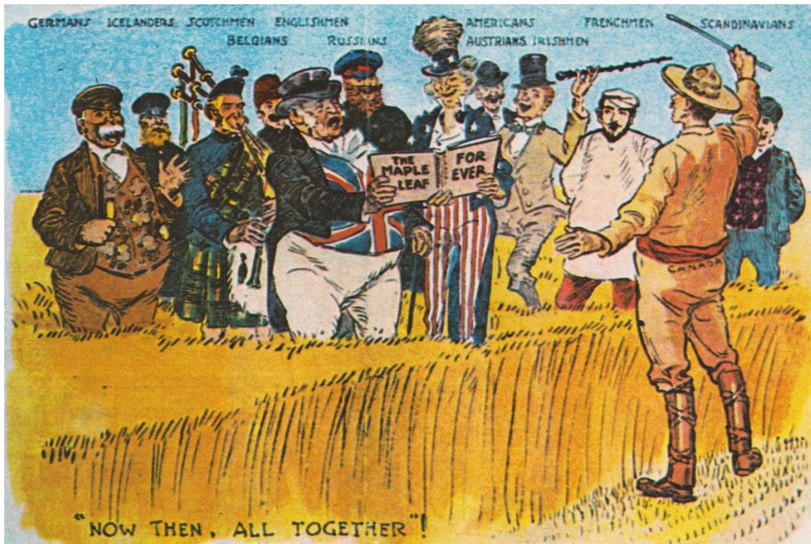
(Figure 11 – A political cartoon saved by Woodsworth)

opening experience which would move Woodsworth into federal politics, but was one of many steps which took Woodsworth to the House of Commons.