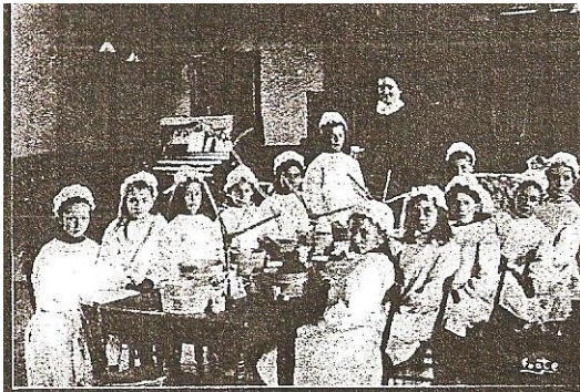
(Figure 6 - A cooking class)

garden club, and the cooking class. (See Figure 6) Girls would begin in the kitchen garden, learning how to grow their own food and how to create healthy meals from the vegetables available. 47 Once they had mastered this, they would graduate to the kitchen where they would take cooking classes. The aim of this class was to “...teach the girls how to make a few cents go a long way and yet have the dishes taste good too.” 48 Once these children were taught the ways of middle-class life in Canada, they would be able to raise the future generations of Canadians. Rev. Samuel East stated that “if they are to become useful members of society, they must have teaching in elementary culinary arts and in sanitary essentials.” 49 Reaching the young girls as they arrived in this country became one of the most apparent examples of how the Social Gospel was dealing with the moral panic over the increasing immigration rate. It represented a clear assimilation and nativist theme in the work done by Woodsworth and his staff at All Peoples’ Mission.