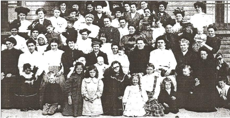
(Figure 10 - Mothers' Meeting)

but toiled for their own, deeply personal reasons. This role that woman held at All Peoples' was in keeping with the role that women were enjoying across the Anglo-protestant world. In fact, in Canada women played a central role in establishing the system of social settlements that slowly crept across the landscape. One in particular, an American, established the first social settlement in Canada – Sara Libby Carson should invariably be treated as the mother of social settlements in Canada.