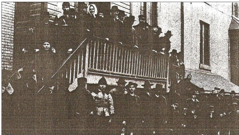
(Figure 5 - Immigration