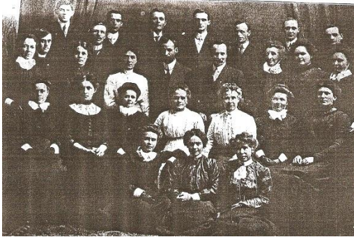
(Figure 7 - Workers at All Peoples' Mission)

denominations as well as socio-cultural backgrounds. This, Woodsworth boasted, was what made the All Peoples' Mission so effective.