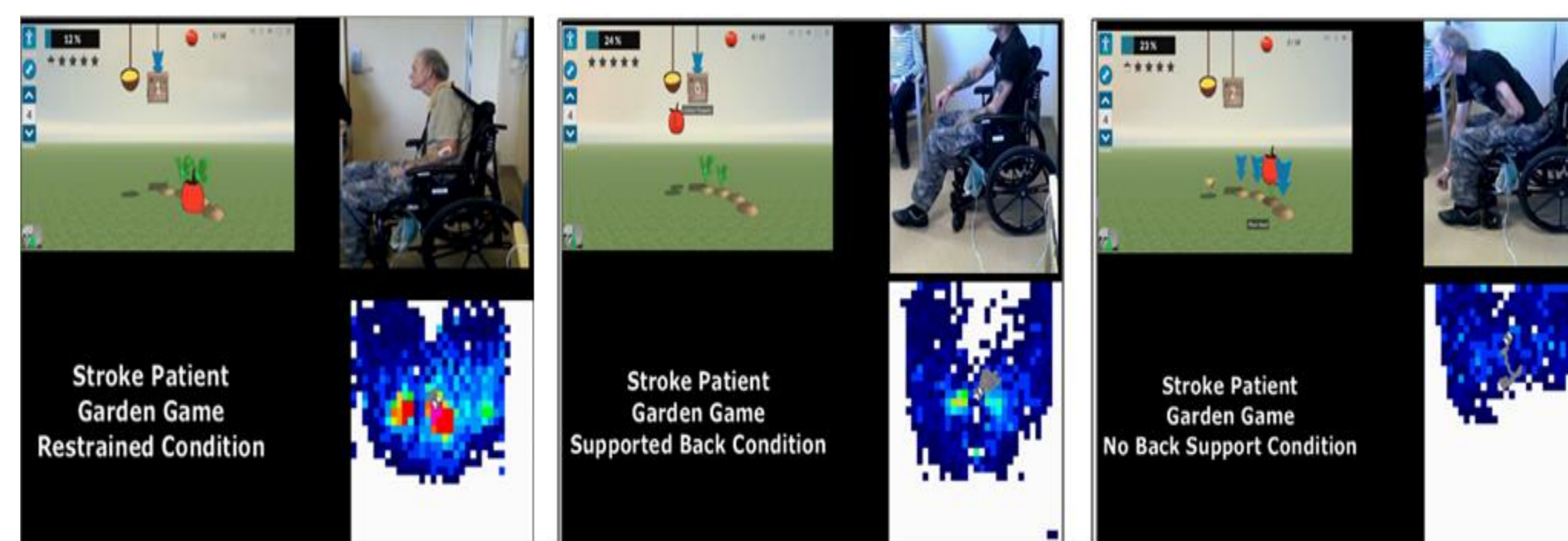
Figure 1. Stroke participant sitting in the Restrained, Supported back and No back support sitting conditions playing VRT games