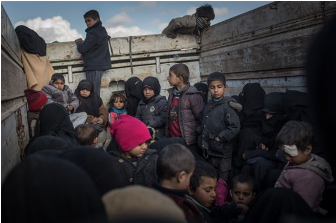
Children are transported to a refugee camp after leaving Bagouz, Syria, on February 11. Bagouz is ISIS' last stronghold.

keep cool. The rations did not include fresh food, even for children. Latrines were overflowing, garbage littered the grounds, medical care and basic provisions such as diapers and sanitary towels were insufficient, and respiratory and gastrointestinal infections, as well as child malnutrition, were rampant." 12 The Kurdish Red Crescent reported that at least 517 people, 371 of them children, died in 2019 in al-Hol, the larger camp, many from preventable diseases. 13