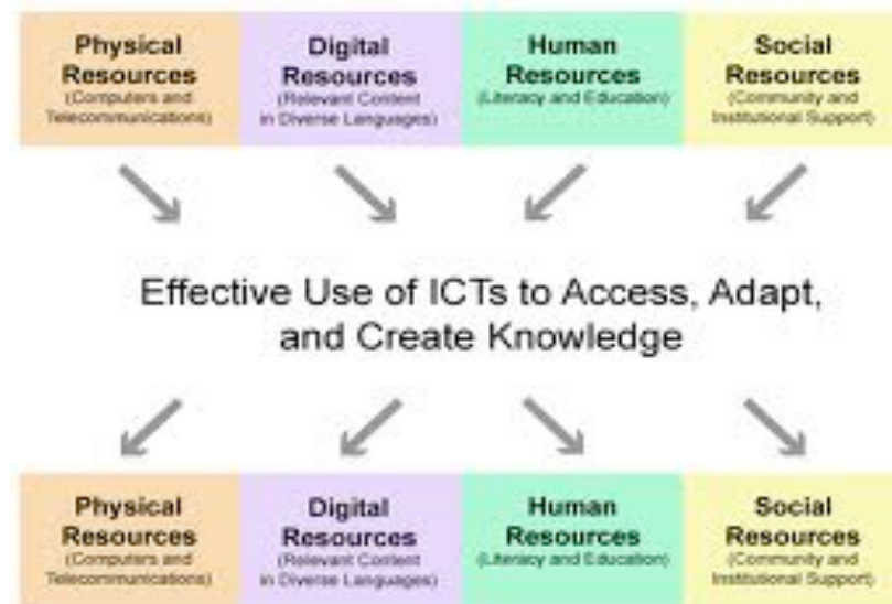
Figure 2. Effective use of ICTs. Taken from “Re-conceptualizing the digital divide,” by M. Warschauer, First Monday , 7.

material possession of computers and Internet service; digital resources , resources available online; human resources such as skills and education; and social resources , which is composed of social capital, and the social relations people create and maintain online.