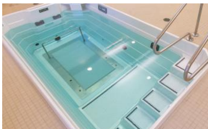
Figure 3. Aquatic Physical Therapy participant in a HydroWorx Therapy Pool.

base is covered with a built-in treadmill. This limits the space for standing exercises that do not use the treadmill. She also raised the issue of patient height in relation to pool depth. In order to correctly and effectively manipulate the reduction of gravity on one's skeletal system, the patient must be fully or almost fully immersed. This can be challenging when patients vary from 5'0" to 6'3". She explains how she addresses this challenge by draining and refilling the pools, but this is time consuming and limited by the height of the filter which makes it nearly impossible to accommodate children for APT; this is demonstrated in figure 3.