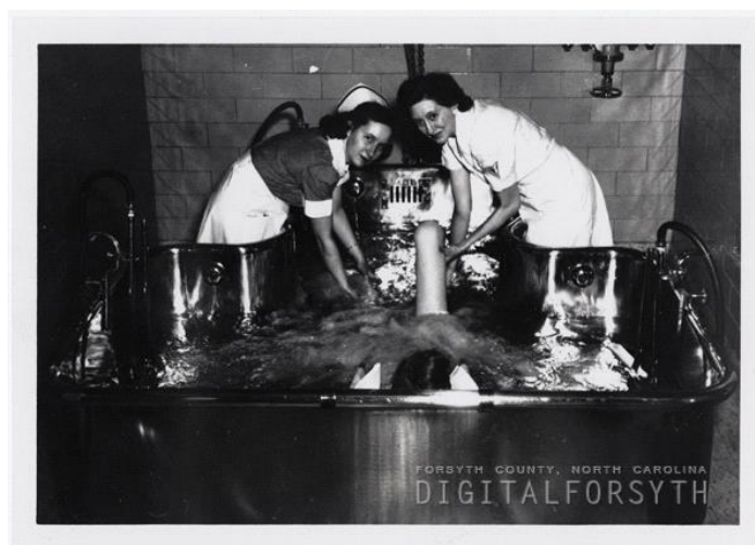
Figure 1. Physical therapist assisting patient in an original Hubbard Tank.

In the early 20 th century, the physical properties of water were identified and utilized for the purpose of active “hydrogymnastics” which involved intentional exercise in water. Hydrogymnastics is the oldest derivative form of APT and was the first implementation of therapeutic exercise underwater versus prior passive water-based treatments (Brody & Geigle, 2009). In 1924, Charles Lowman developed a treatment tank for hydrogymnastics in Chicago for patients suffering from paralysis. In 1928, the first Hubbard tank was developed which was a warm water tank that initiated the development of pool based physical therapy programs in a contained warm-water setting (Becker & Cole, 2005).