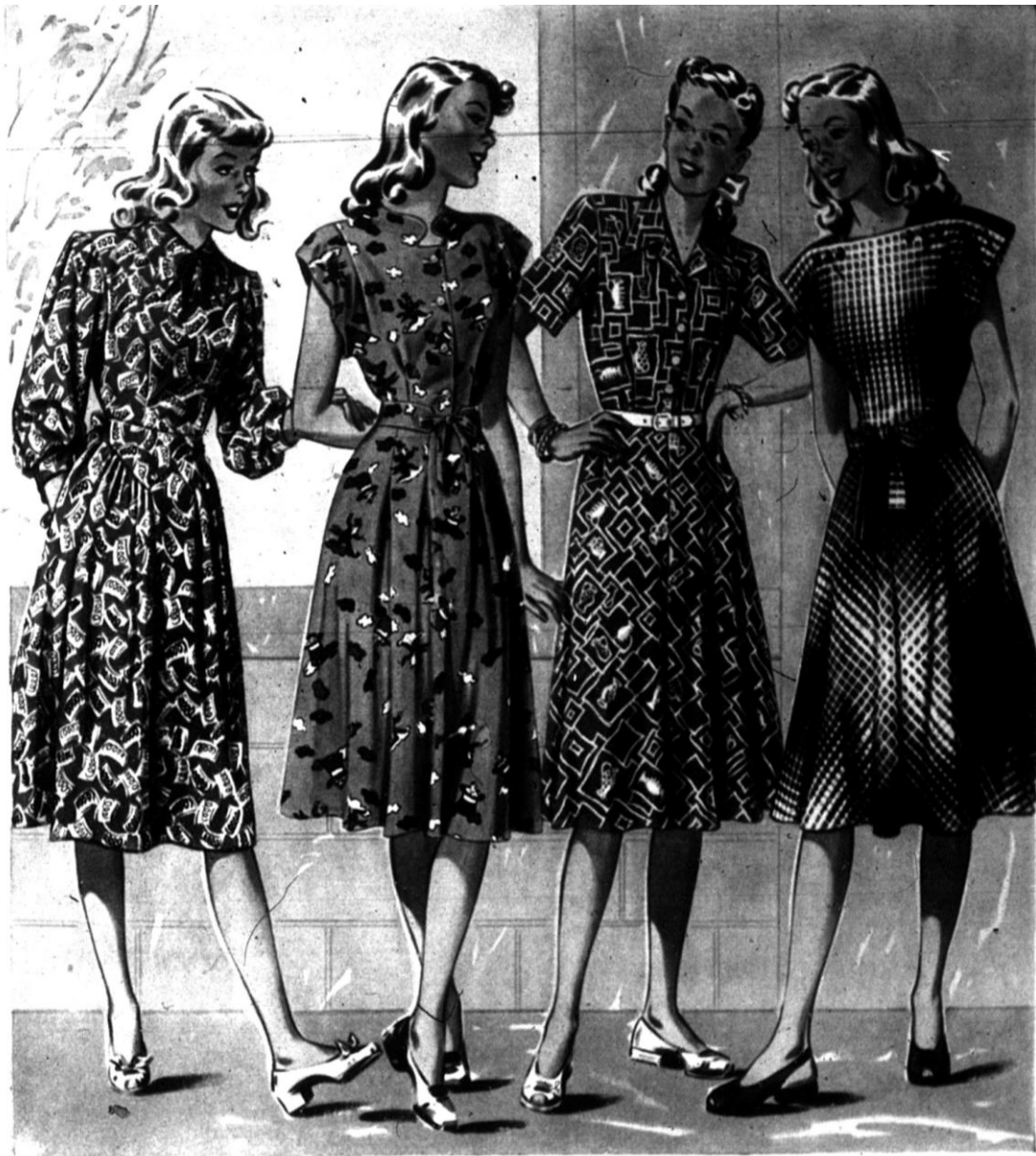
Figure 3.5: Teen dresses modeled in the Spring and Summer 1948 Catalogue.