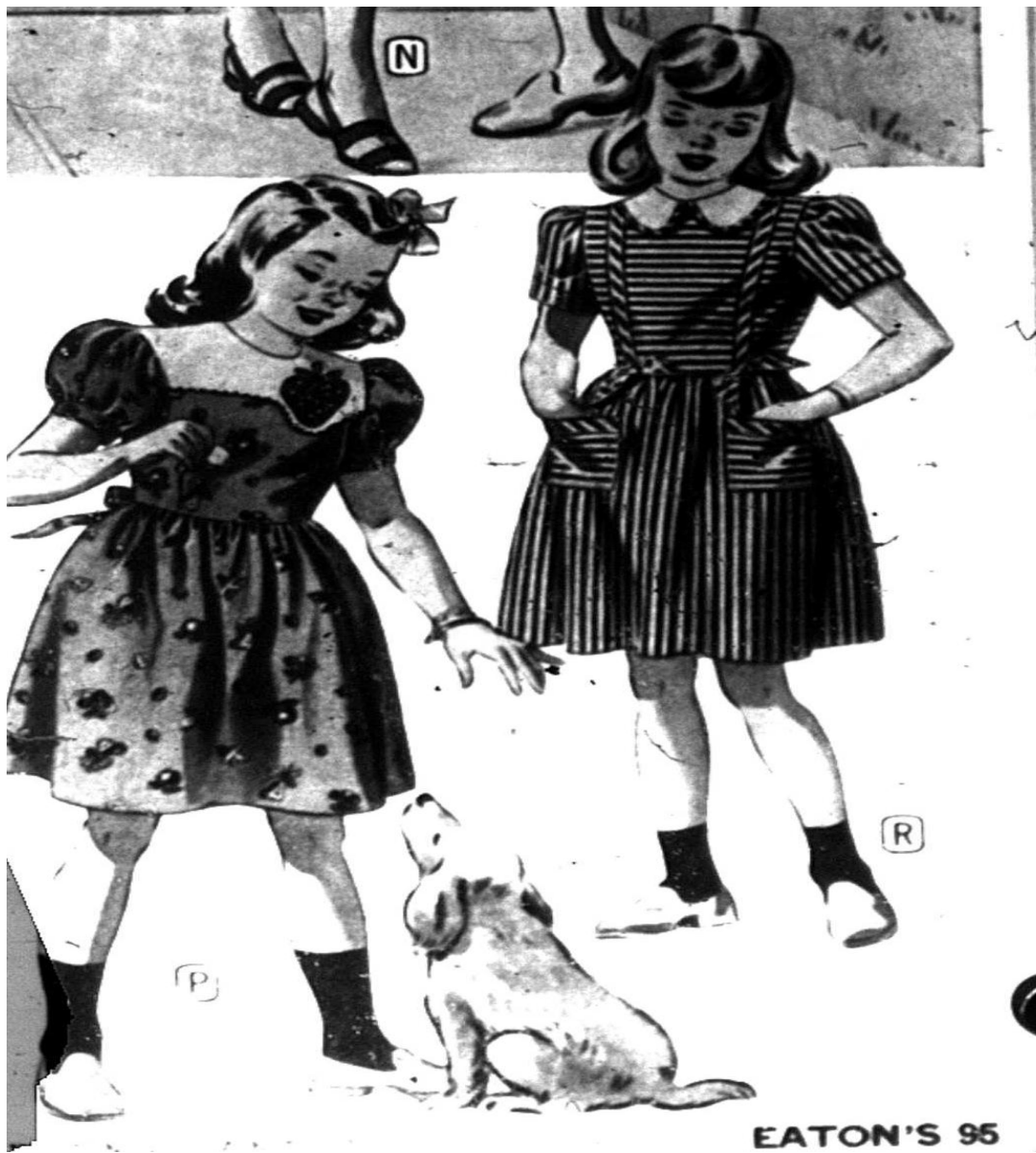
Figure 3.4: Girls' dresses modeled in the Spring and Summer 1947 Catalogue.