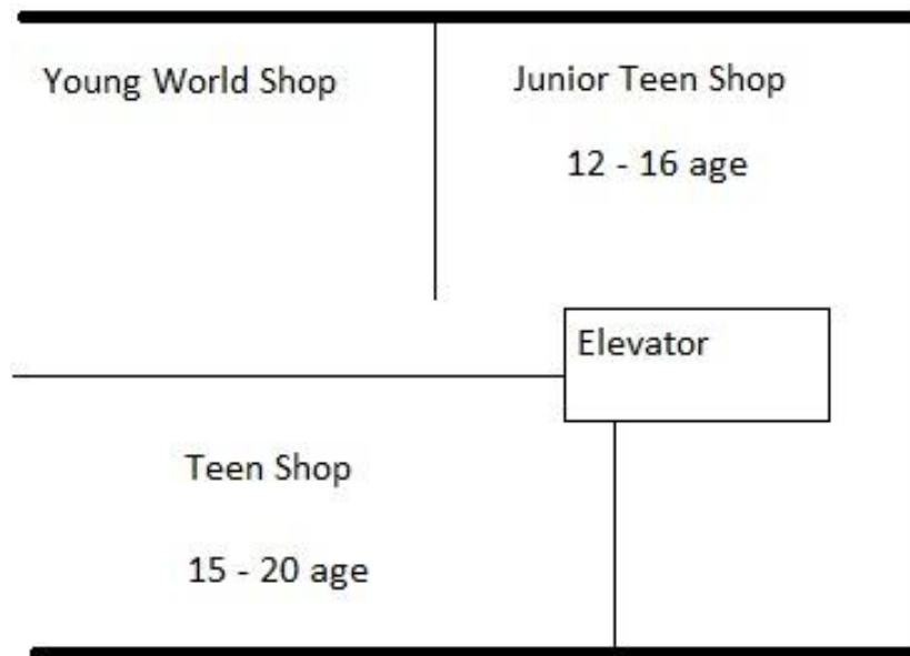
Figure 5.3: Line drawing reproduced from B. Warner's sketch of a proposed floor plan creating separate and larger departments for teenagers. In "Hi-Spot" memo to Jack Brockie from B. Warner, n.d. 151-229, Archives of Ontario.

It is unclear if the Merchandise Display Department followed Warner's advice and eliminated the Hi-Spot section. Reorganizing an entire floor to cater to ever-more-specific age groups could be a risky proposition, particularly if teenaged girls were going to continue to shop in a variety of departments. However, the problems with the Hi-Spot reveal that Eaton's was struggling to establish how and where to best sell clothes to teenagers. The company was relying on the opinions of Junior Councillors and Executives to help determine how to alter its stock and store layout.