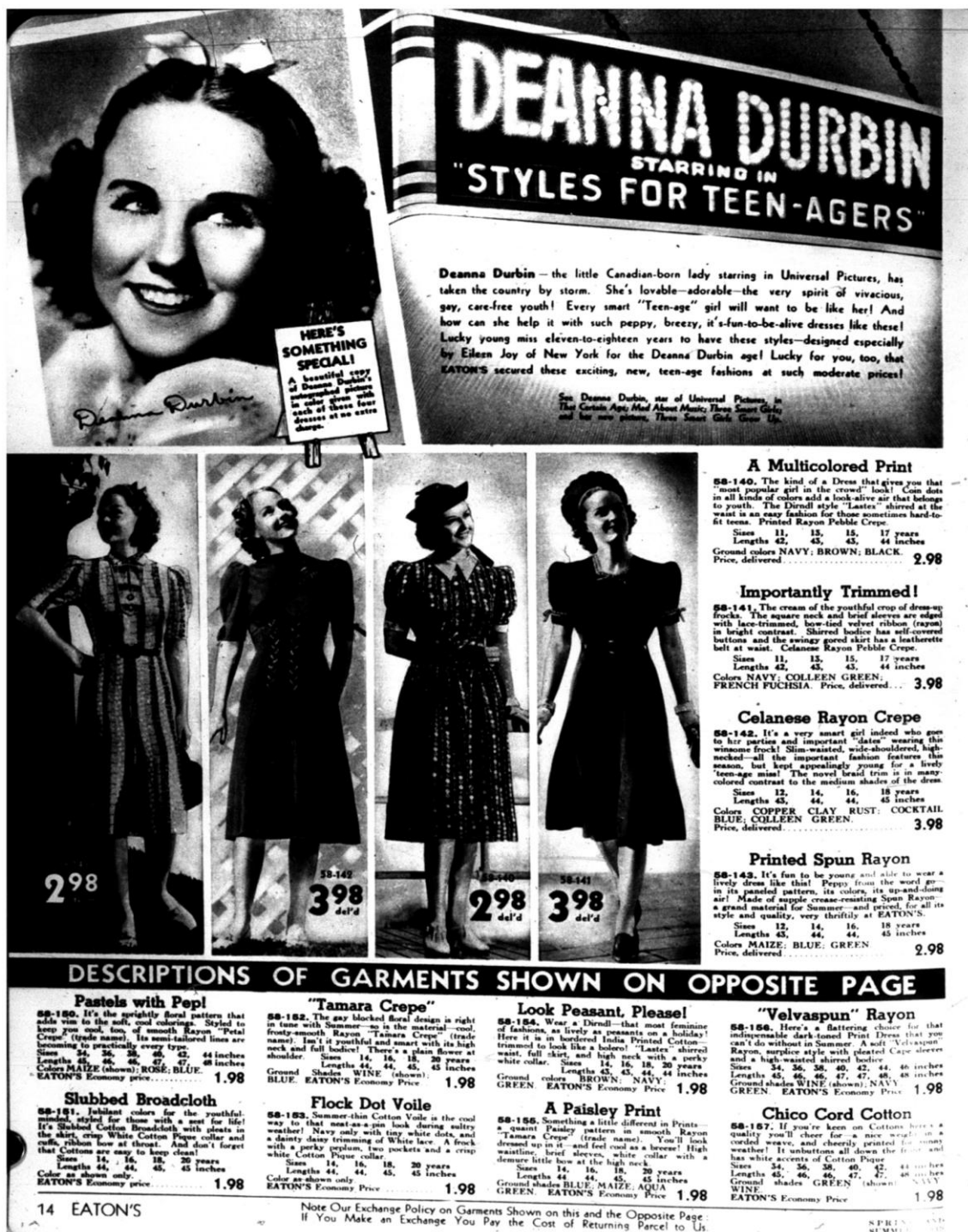
Figure 3.3: "Deanna Durbin Starring in 'Styles for Teen-Agers,'" Eaton's Spring and Summer 1939 Catalogue.