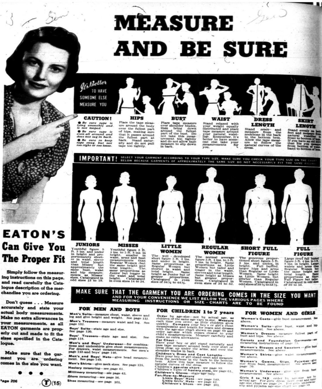
Figure 3.1: Measuring instructions from Eaton's Spring and Summer 1940 Catalogue.