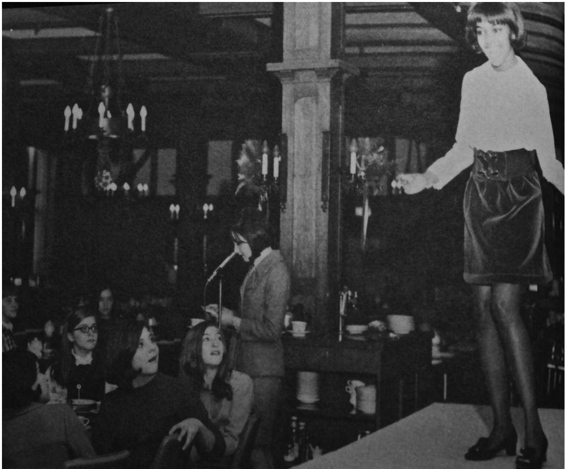
Figure 5.1: Members of the Winnipeg Junior Council participate in a fashion show at the Grill Room in the Eaton's store, undated. From Russ Gurluck, A Store Like No Other: Eaton's of Winnipeg . Winnipeg, Manitoba: Great Plains Productions, 2004.

scenes, the fashion shows appeared to the audience as exclusive teenaged spaces. The absence of adults on stage and at the microphone enhanced the impression that young people were mature enough to express their own consumer desires.