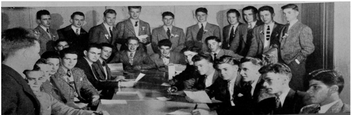
Figure 5.2: The Toronto Junior Councils and Junior Executives (pictured above), undated. These two photographs appeared in a company-produced history of Eaton's, and illustrate the gender differences that played out in weekly council meetings. The girls are pictured smiling, chatting, and admiring several items of clothing, while the boys mimic a board meeting, with pens and papers poised to conduct business. From The Story of a Store: the history of Eaton's from 1869 . Toronto: T. Eaton Company, 1947.