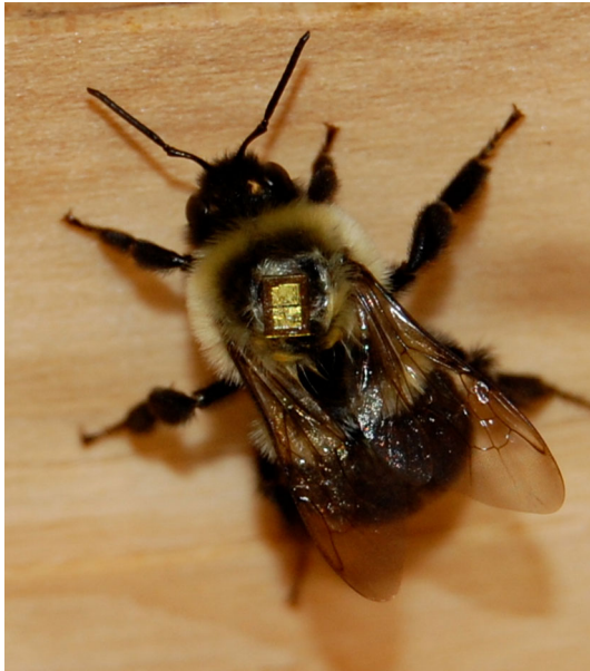
Fig. 2 B. impatiens worker tagged with RFID chip.

evenly shared (Free, 1955). Individual differences are not especially problematic in procedures where the number of unrewarded choices of stimuli is fixed. When bees are given unrestricted access to a flight cage, however, some bees will invariably make considerably more choices than others, and the issue arises as to their representativeness. A sample of undifferentiated ‘bee-choices’ (e.g. Lehrer et al., 1995) gives little guide as to whether the results might reflect the behaviour of only a few particularly active bees. Individual differences (e.g. Orbán and Plowright, 2013), colony differences (Plowright et al., 2011) and population differences (Skorupski et al., 2007; Ings et al., 2009) have been reported.