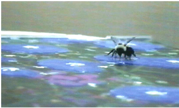
Fig. 3 Flower-naïve bumblebee ( B. impatiens ) extending its proboscis towards a photograph of a flower.

2010). Colour vision functions only, however, at relatively short distances: up to 10 cm for a grating with a spatial period of 2 cm, or subtending an angle of 15^\circ in honeybees, but only 2.7^\circ in bumblebees (Lehrer et al., 1988; Land, 1997; Macuda et al., 2001; Chittka and Raine, 2006). Honeybees use green-contrast (i.e., grayscale vision) to an angle subtending up to 5^\circ ( 2.3^\circ for bumblebees) but beyond this point, the shapes of objects become indistinguishable (Dyer et al., 2008). The evolution of insect colour vision is reviewed by Briscoe and Chittka (2001).