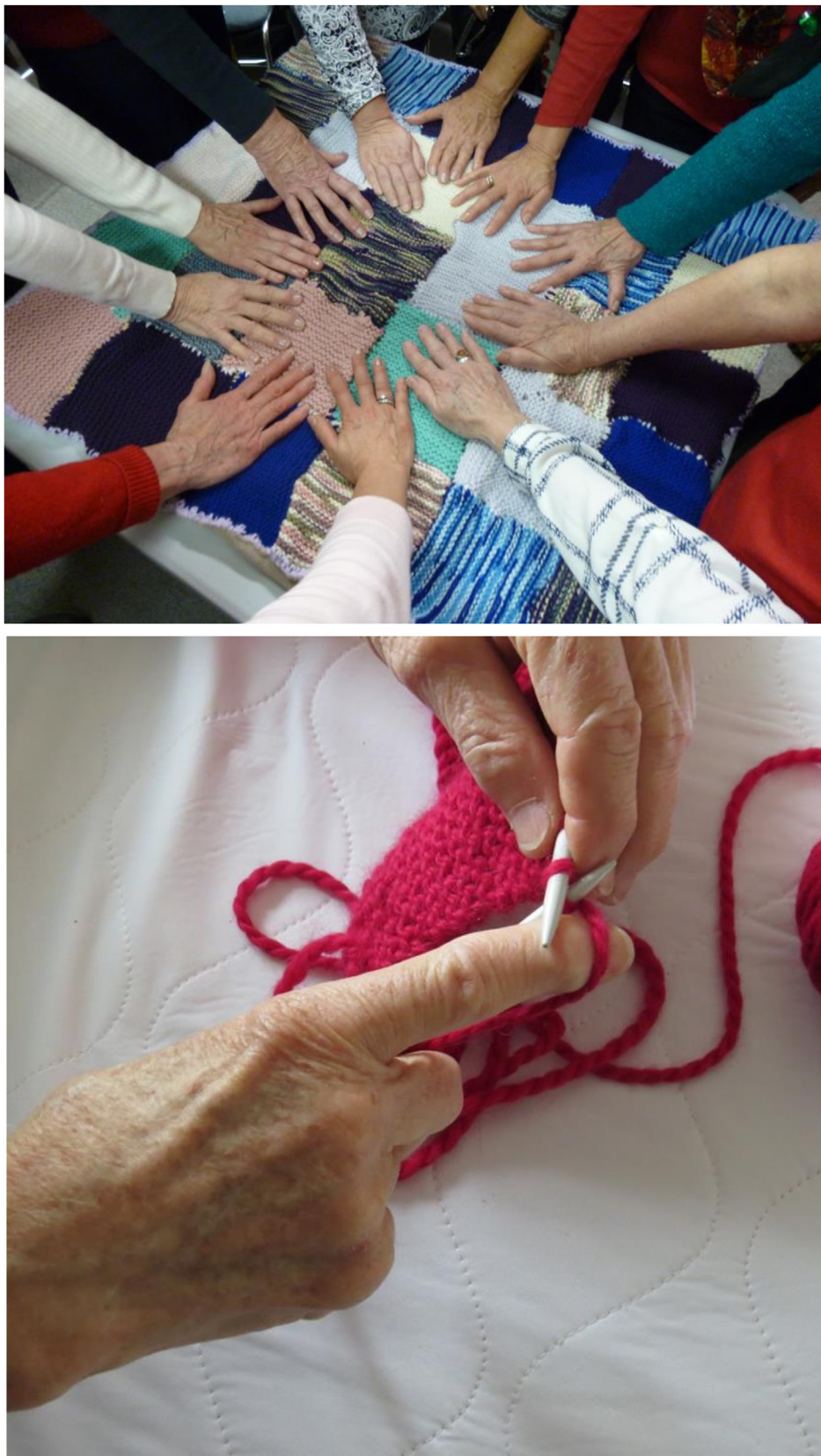
Fig. 1. Knitting intervention.