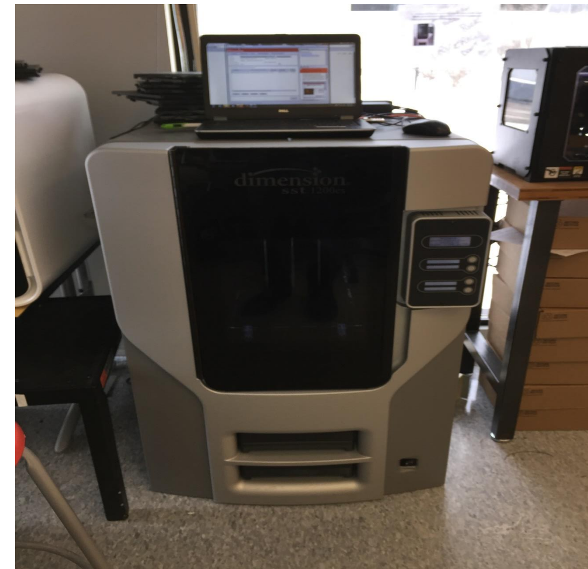
Figure 1 : Dimension SST (3d printer used)