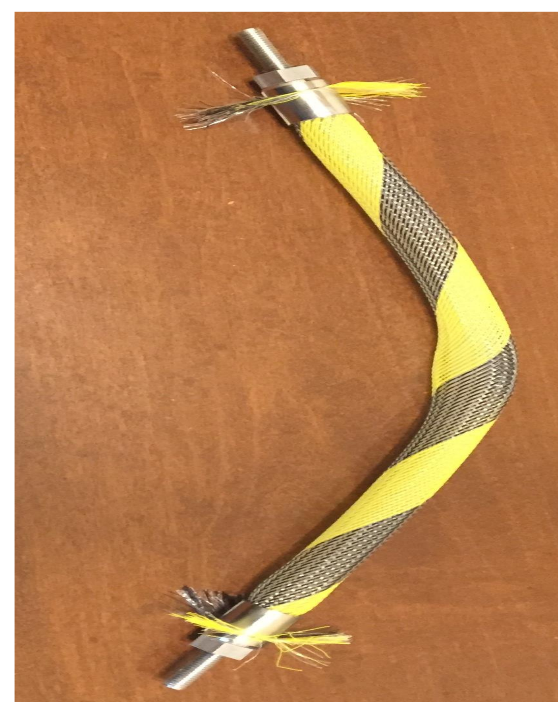
Figure 4 : Pneumatic artificial muscle