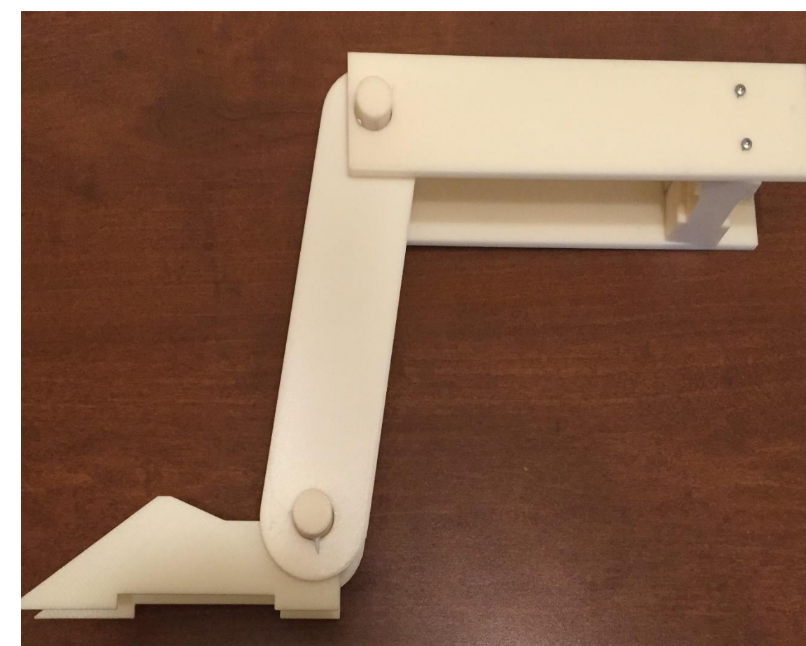
Figure 2 : Side view of exoskeleton