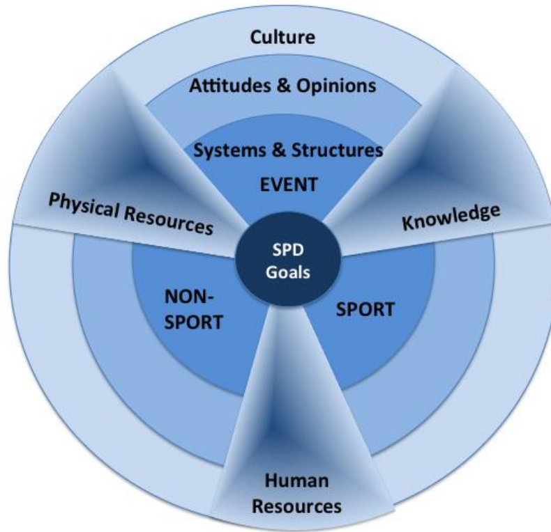
Figure 1: Model for leveraging sport events for participation (Chalip et al. 2017, p. 261)