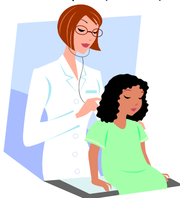
Table 3.4: Health services received by placement setting and overall.