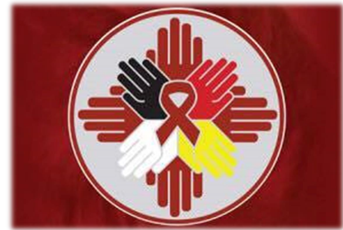
Figure 3. CDN Aboriginal AIDS Network

Evaluation of the findings reveals that AB people residing in rural areas had significantly longer wait times for health care, less access to sterile equipment provided by needle exchange programs, and due to stigma and mistrust associated with social and ethno-cultural factors as well as a lack of privacy and confidentiality, were less likely to seek HIV testing 2,3,9 . Significant predictors for HIV in rural and urban areas include: syringe sharing, frequency of drug injection (speedball, cocaine, heroin), younger age, high STI rates, frequency of unprotected heterosexual sex, frequency of non-consensual sex, residing in a metropolitan area, generational sex work, and men having sex with men 6,10-12 . Risk factors for HIV acquisition appear to vary by gender as well 2 .