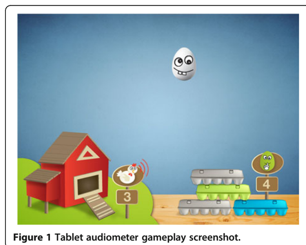
Figure 1 Tablet audiometer gameplay screenshot.

Study participants were recruited from patients presenting to the Audiology Clinic at the Children’s Hospital of