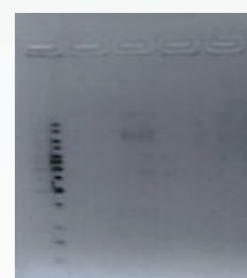
Figure 4: 1% agarose gel electrophoresis of ligation product. The ligation product (lane 3) has the expected size of the mammalian expression vector containing the gene of interest (8000-9000 bp), judged by comparison to a 1kB GeneRuler DNA ladder (lane 1). It is also evident that the ligation product is larger than the empty linearized vector as visualized in Figure 3.