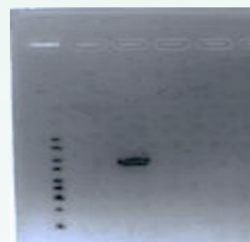
Figure 3: 1% agarose gel electrophoresis of digestion products. The double digested mammalian expression vector (lane 3) was confirmed to have a size of approximately 5500 bp by comparison to a 1kB GeneRuler DNA ladder (lane 1). The double digested gene (lane 2) is too dilute to be visualized.