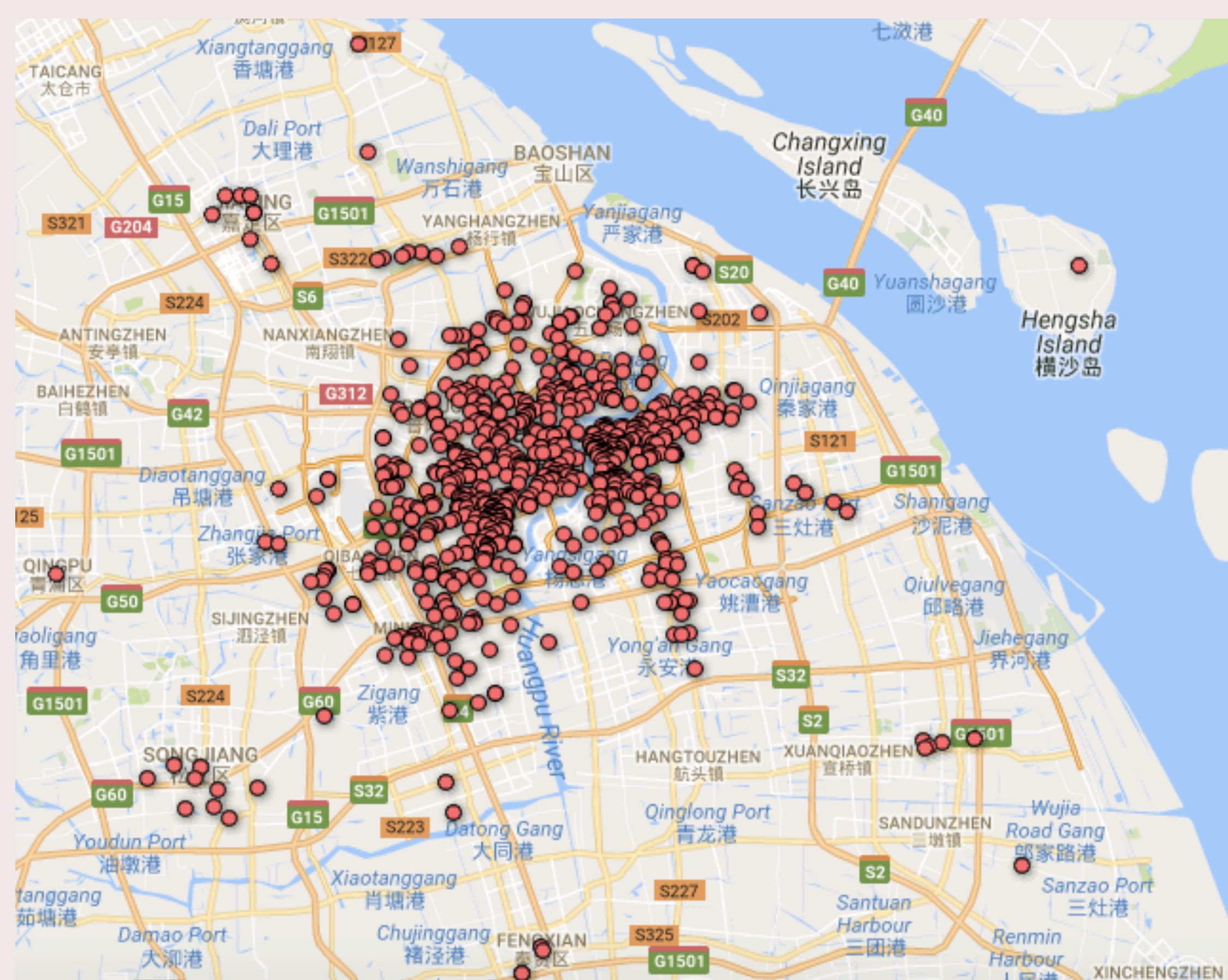
Map of Shanghai

855 out of 984 listings were valid links.