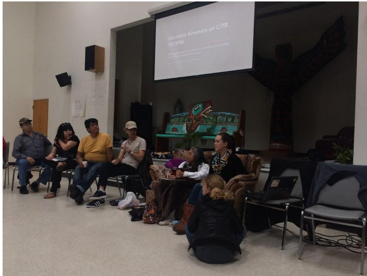
Unceded Airwaves, Indigenous Collective (CiTR FM)