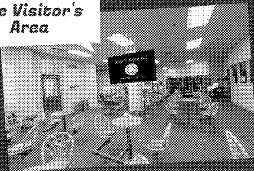
The Visitor's Area