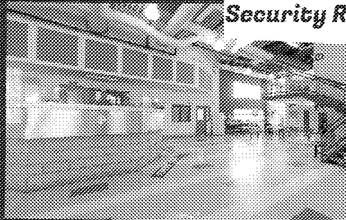
A Medium Security Range